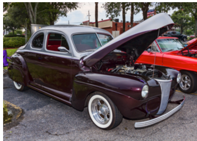
This is one of the nice cars displayed at the Cruisers' Cruise-In August 16 th The other nice cars from that event are on the last two pages.—