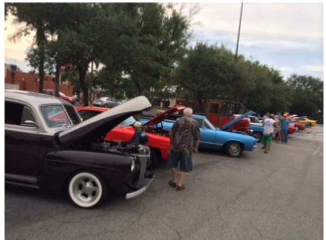
The St. Augustine Cruisers held their regularly scheduled cruise-in on August 16 th —ACAC joined in for the fun.