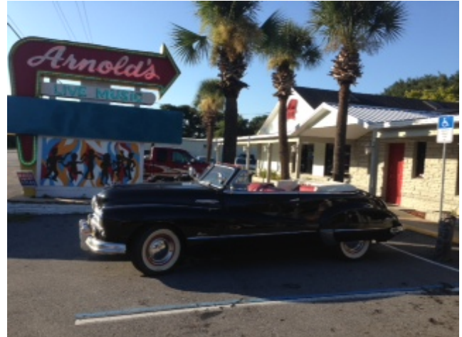
Quackenbushes' '48 Buick Convertible