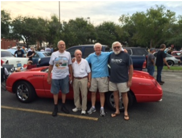
These guys will have fun, fun, fun, till their daddy takes the T-Bird away.....