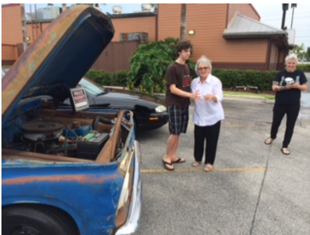
Who says we can't dance?