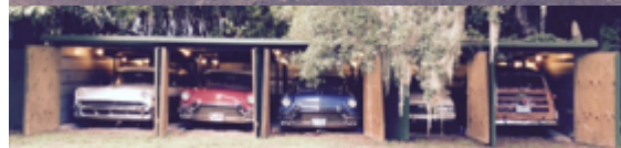
Members of the Coachmen Club visit “The Cave” August 15, 2015—fun.