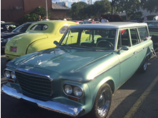
Very Unusual Car—Can you Identify it?