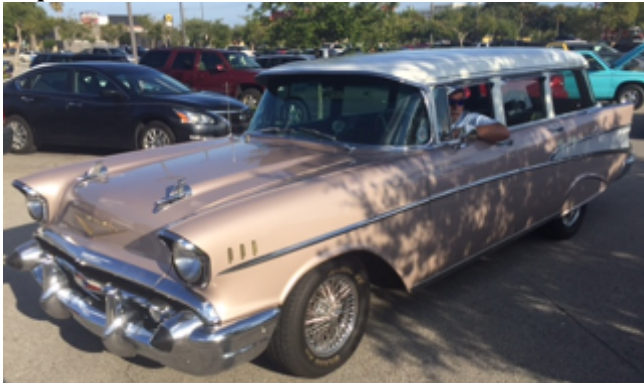
Max Miller's cool '57 Chevrolet Station Wagon