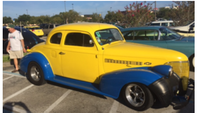
Every month there's something new!