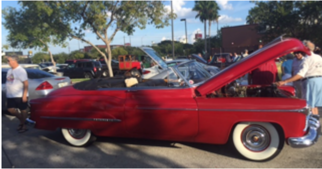
Arpaia's beautiful red '50 Olds Convertible