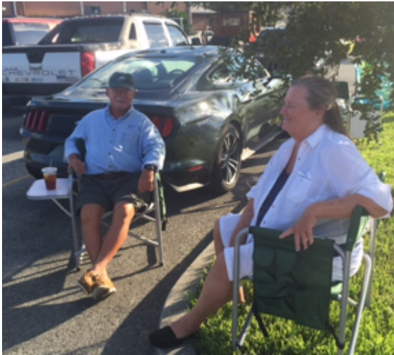
Hunsworths enjoy "un-beach" time.