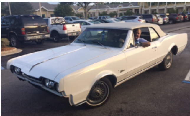
Hope and Ray racked up another blue ticket!

Dues will be coming due. Please save the form from your AACCA magazine to submit with your dues. Dues must be paid before the end of October to attend the Christmas Party 12-10-16.