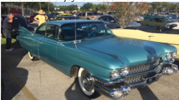
So long, so lovely!