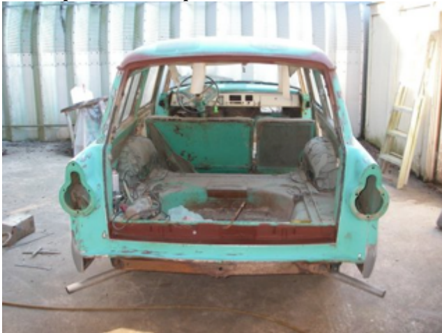
After and before! And after.