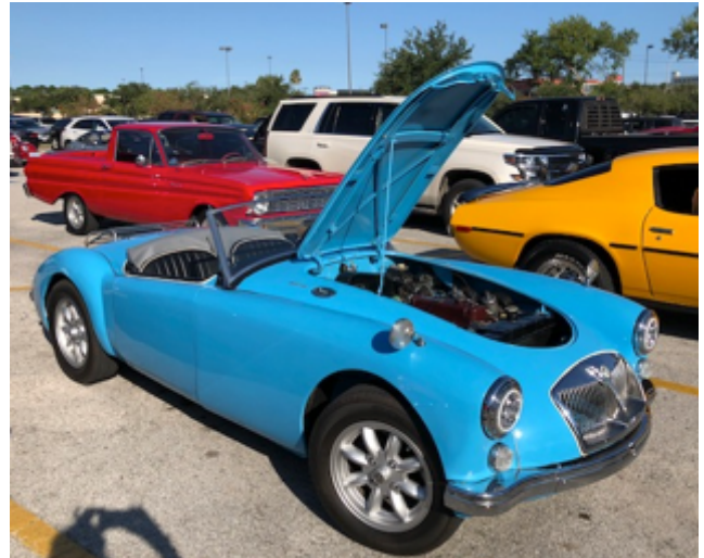
Primary colors seemed to be in order.