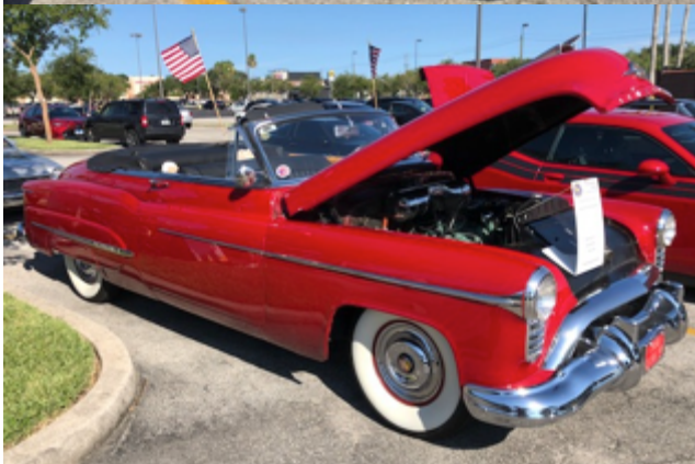
Always lovable—Arpaias's Oldsmobile