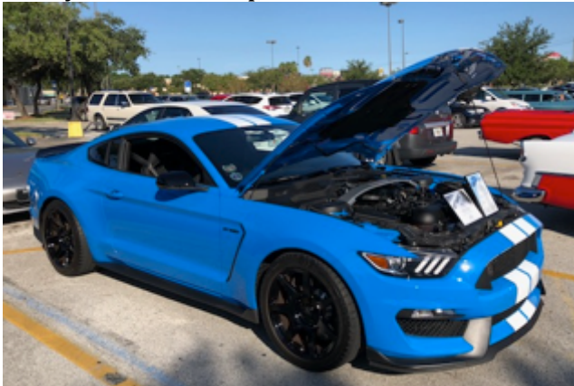
Plenty more cars—come and see for yourself! Brits represented, too!