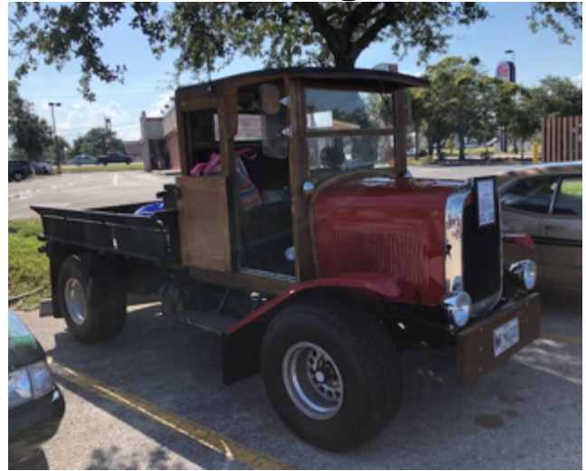
Mr. Magoo is always a favorite!