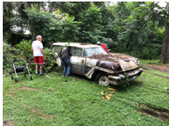
For the rest of the story see page 14