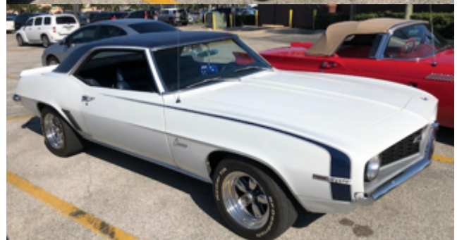
These are only a few of the great cars that congregate monthly behind Longhorn's Steakhouse. Nice night; good venue.