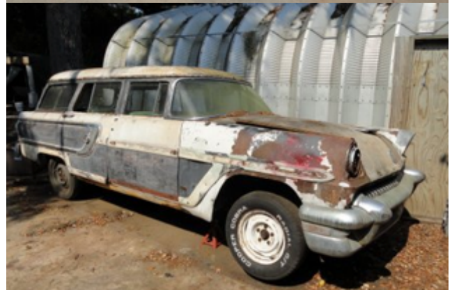
For a while she rested here; then she was placed along the fence lines to face the hurricanes, etc. on her own.