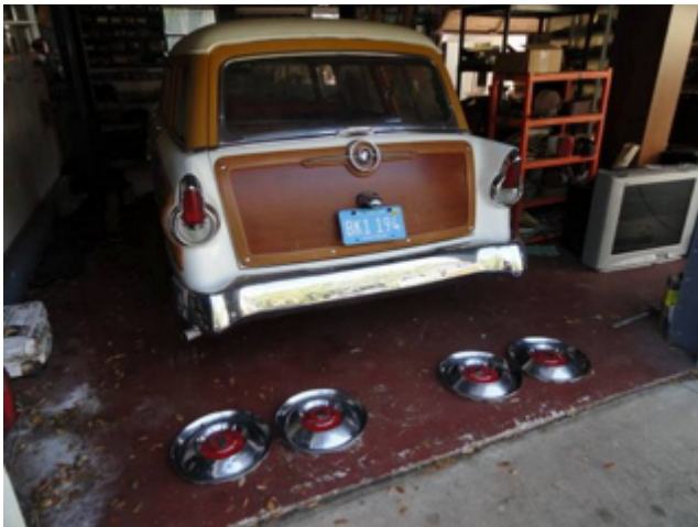
Hubcaps all lined up.