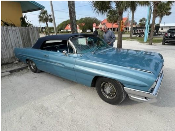
Peter Starr's 1961 Pontiac convertible