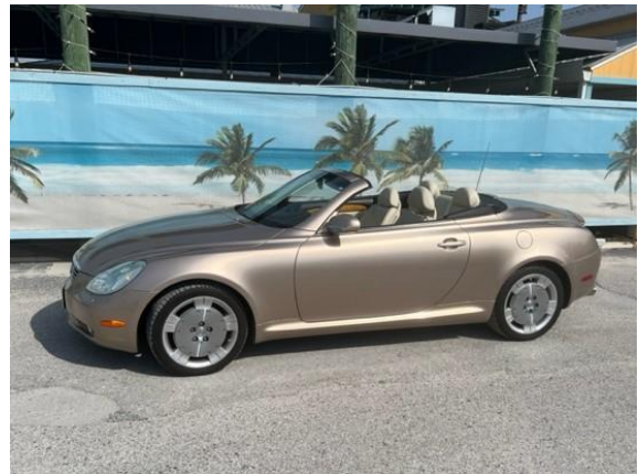
Joe Greeves's Lexus SC430