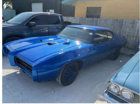
Skip Ferguson's 69 Pontiac GTO