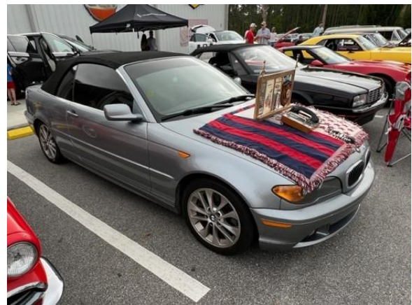
Ron Leone BMW