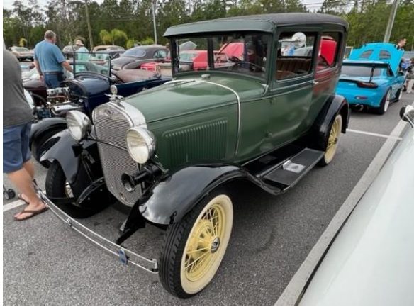
Jim Athas Model A