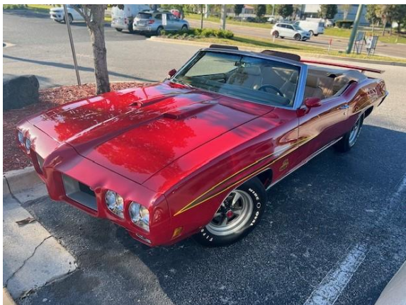
Pat and Dan Norbut's '68 Pontiac GTO