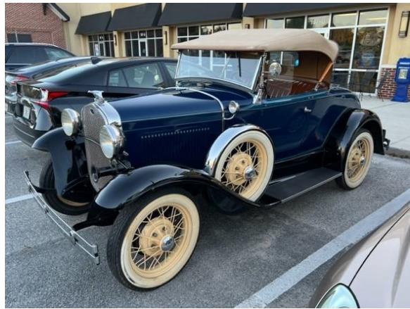
Toby and Karen Erwin's '31 Model A Deluxe Convertible