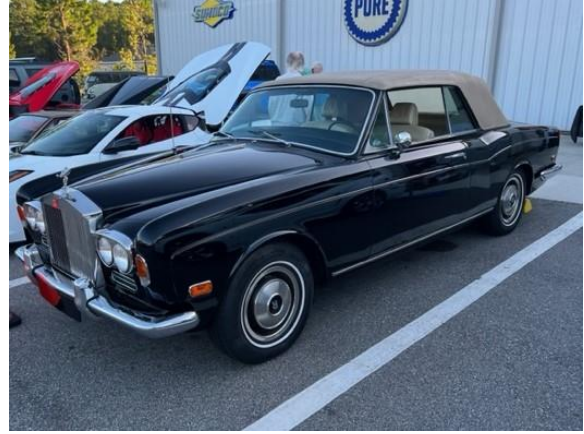
Jim Weiss – Rolls Royce