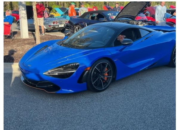
The new McLaren

The list of Up Coming Events is distributed separately every Monday.