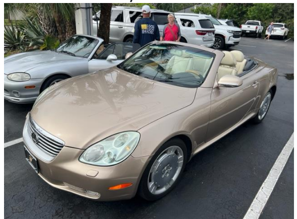
Joe Greeves – '04 Lexus SC 430