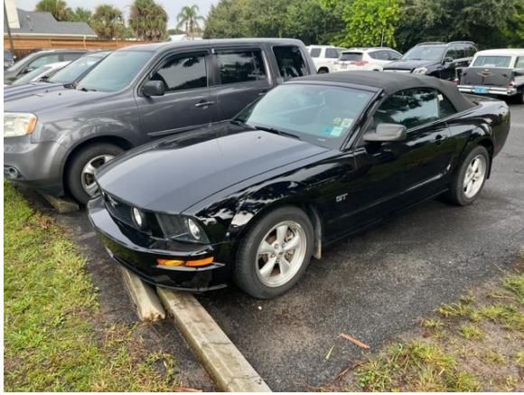
Dick Hewitt, '07 Mustang