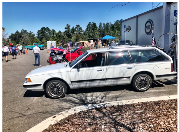
Dewey Porter '93 Buick Century