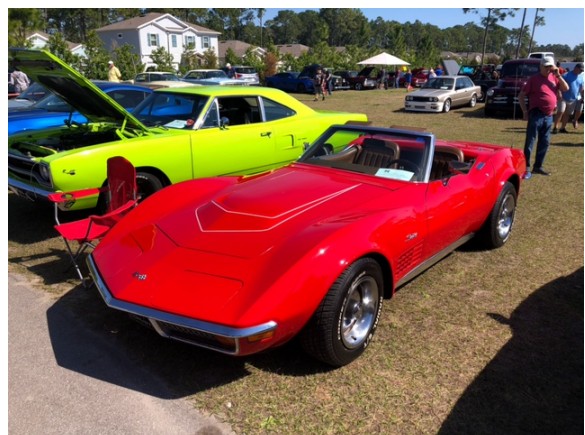
Geoff Nadler, '72 Corvette Stingray