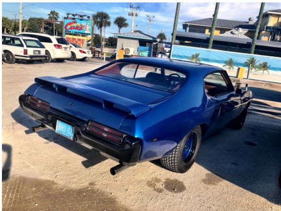
Skip Ferguson, 1969 Pontiac GTO