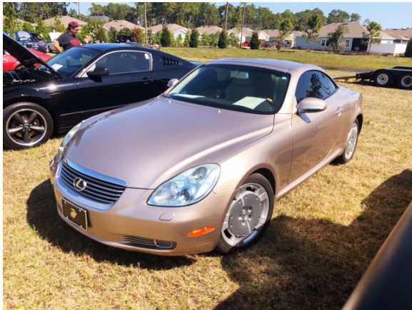
Joe Greeves, '04 Lexus SC-430