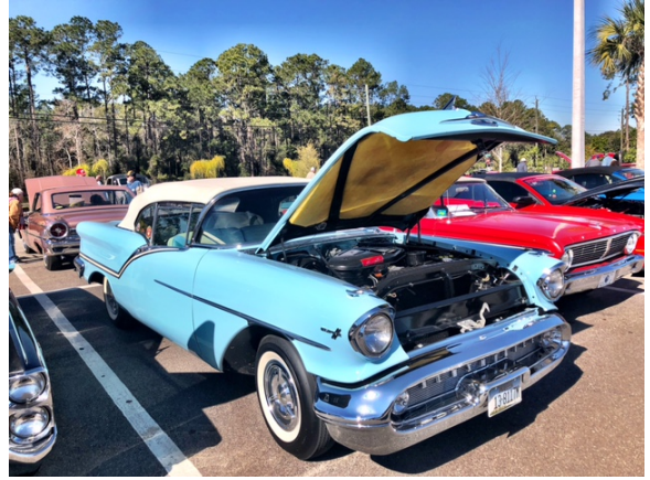
Chris Koch, '57 Oldsmobile Super 88