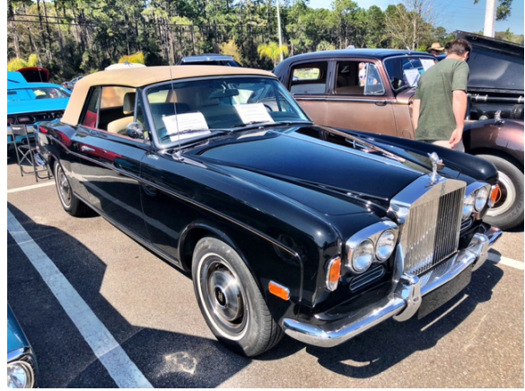
Tuni Weiss, '72 Rolls Royce Corniche Drophead