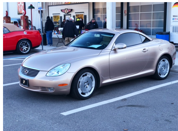
Joe Greeves Lexus SC-430