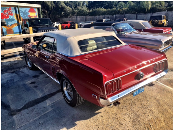
Chris Zima, 1969 Mustang convertible