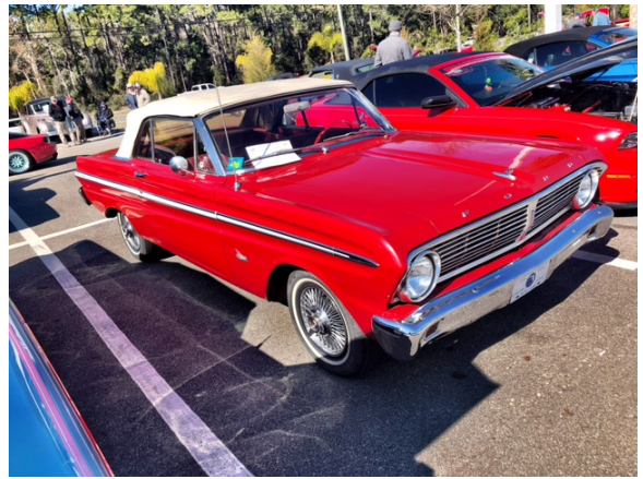
Jim Weiss, '65 Falcon