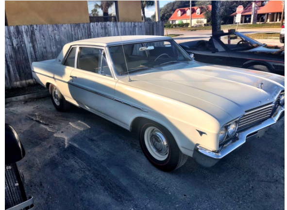
Glenn Bakst, 1965 Buick