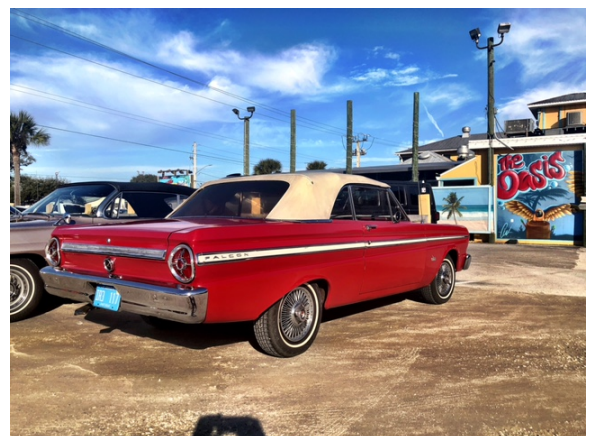
Jim Weiss 1965 Ford Falcon