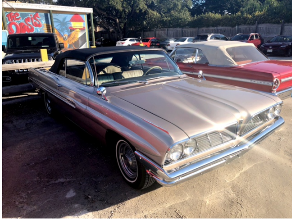
Peter Starr, 1961 Pontiac convertible