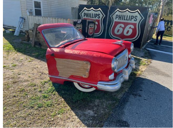
Project car anyone? Needs a little work.