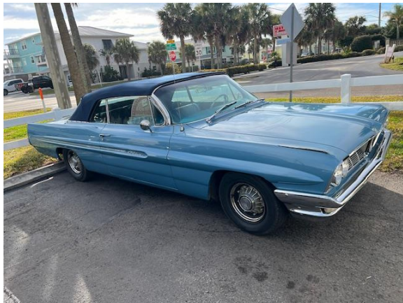
Peter Star – '61 Pontiac