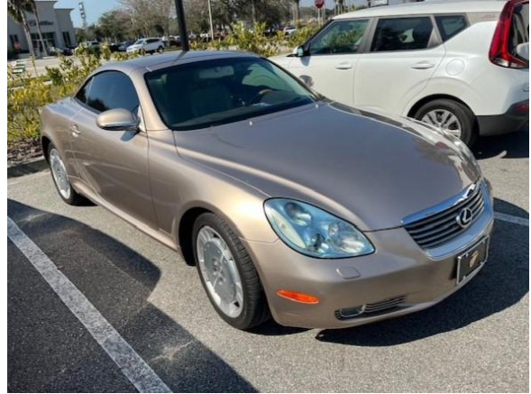
Joe Greeves - Lexus