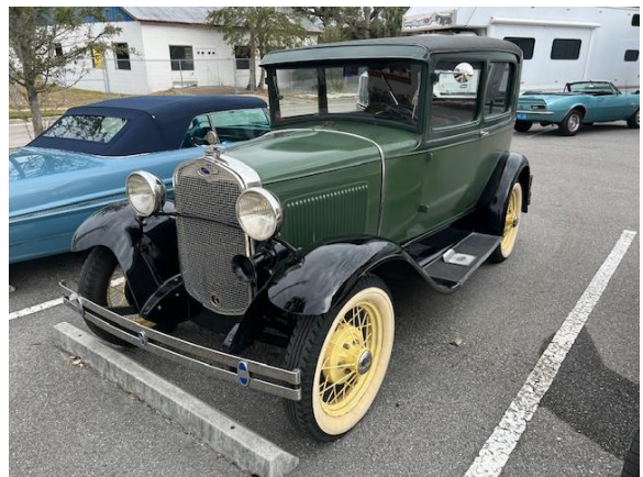
Jim Athos – '30 Model A