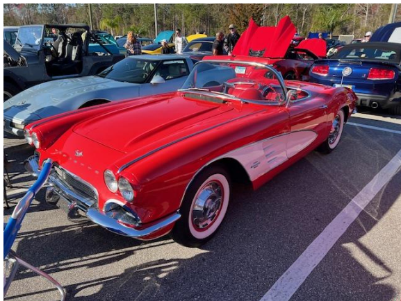
Bill Soman's classic Corvette.