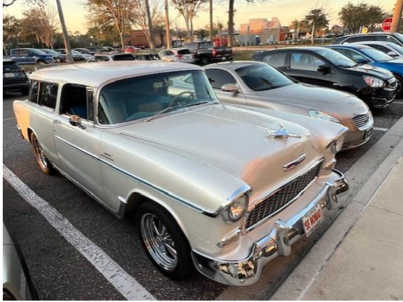
Skip Ferguson – '55 Nomad