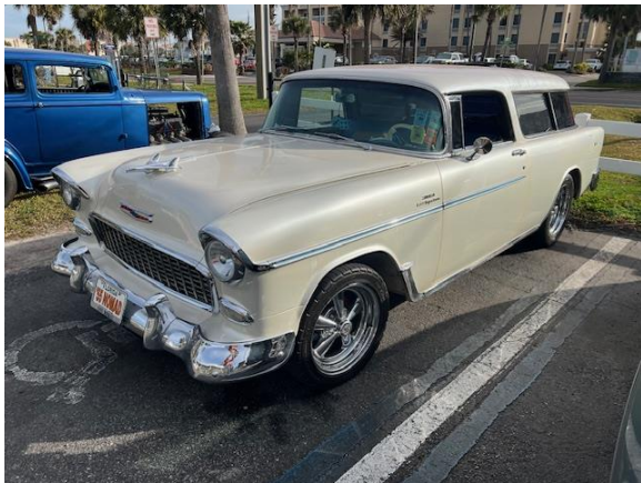
Skip Ferguson – '55 Nomad