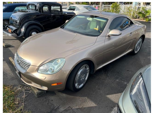
Joe Greeves - Lexus