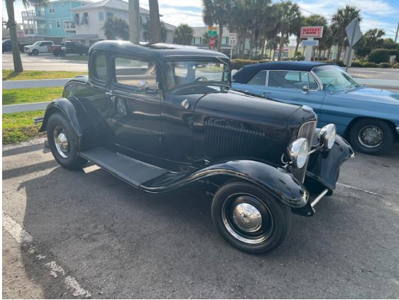
Chet Sveistrup – '32 Ford Hot Rod