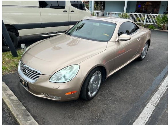
Joe Greeves, Lexus, SC 430