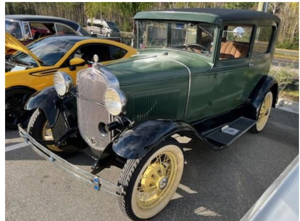
Jim Athas' classic 1930 Ford Model A