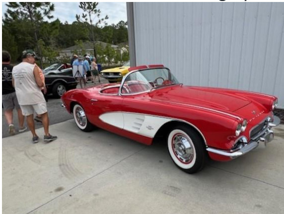
Bill Soman's classic 1961 Corvette