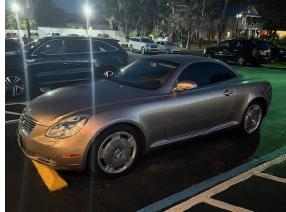
Joe Greeves, Lexus, SC 430