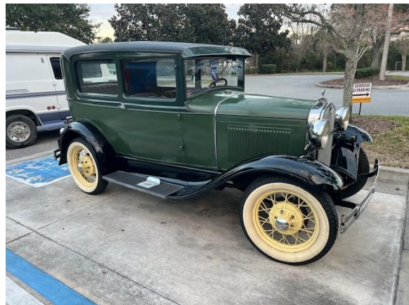
Jim Athas – '30 Model A