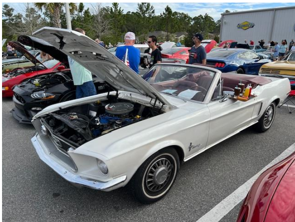
John Bagg's 1968 Mustang convertible comes complete with drive in food tray.