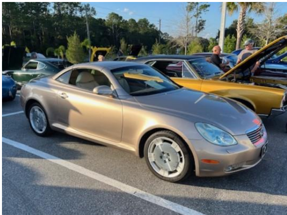
The aerodynamic 2004 Lexus SC430 of Joe Greeves