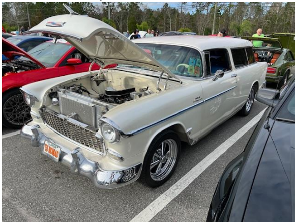
Skip Ferguson owns this beautifully restored 1955 Chevrolet Nomad.