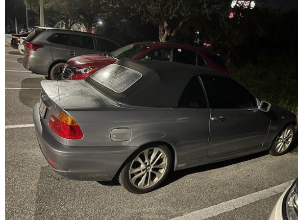
Ron Leone's '04 BMW 330 Convertible