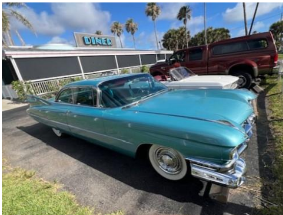
Chet Sveistrup – '59 Cadillac