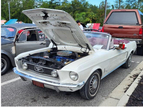
John Bagg – '68 Mustang

All too soon the morning show was finishing to the loud roar of hot cars with very loud and thrilling exhaust manifolds as they sped north in front of the museum off to other engagements for the day.