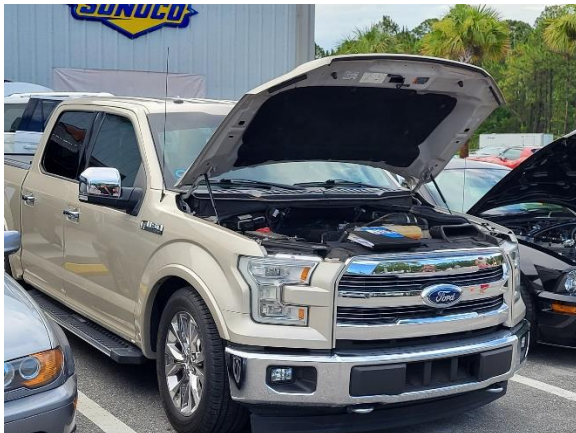
Skip Ferguson – '04 F-350 King Ranch