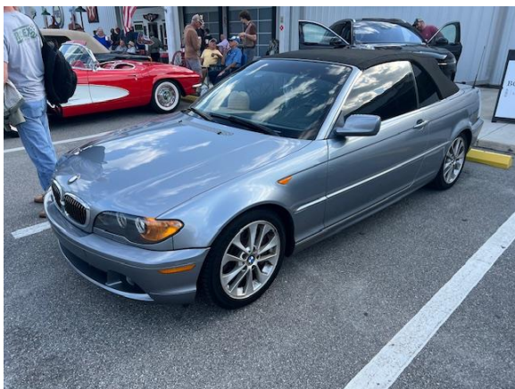
Ron Leone – '04 BMW 330