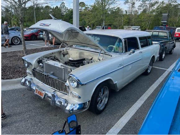
Skip Ferguson – '55 Nomad