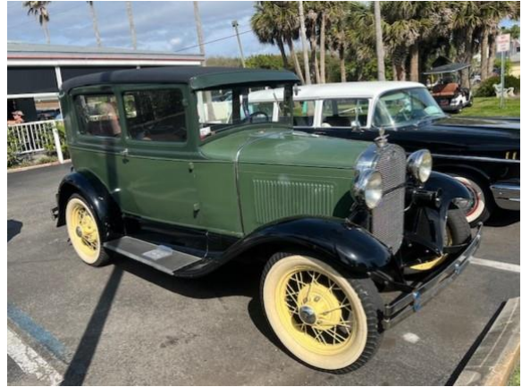
Jim Athas – '30 Model A