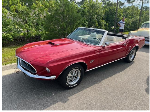
The 1969 Mustang convertible of Chris Zima