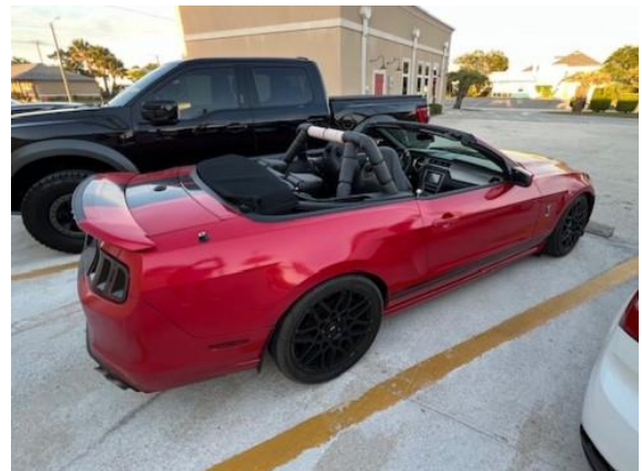
Bill Marshall's Mustang convertible, complete with roll bar.