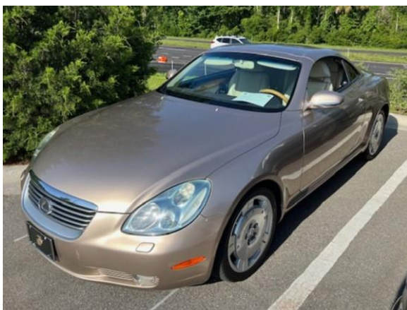
The 2004 Lexus SC430 of Joe Greeves