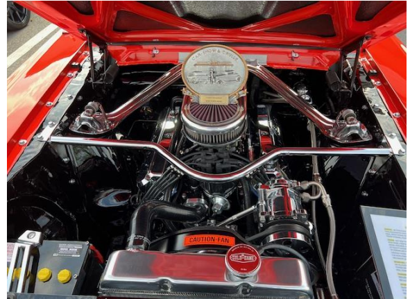
The detailed engine compartment showcases the 5.0 Roller V-8.