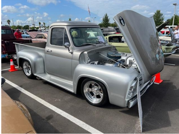
Sidney Hobbs' Ford F-100