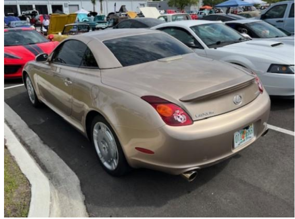
Joe Greeves' Lexus SC430