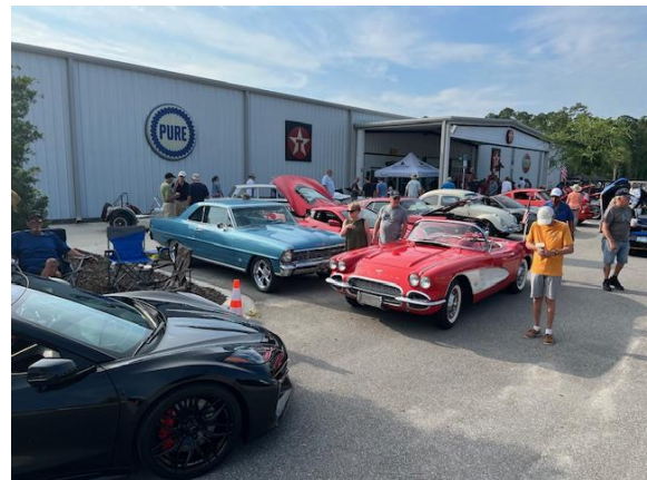
The Museum was packed with visitors for the May Cars and Coffee.