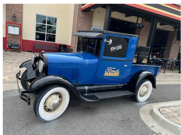
Ford's Garage was an enthusiast's delight.