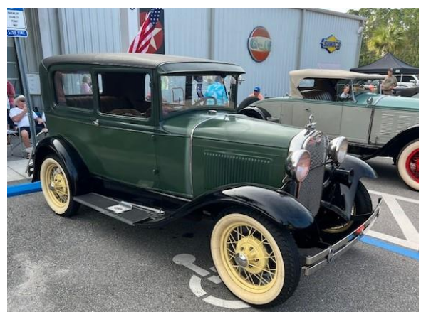
The 1930 Model A of Jim Athas