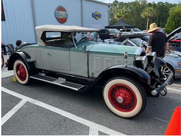
The classic Willys-Knight roadster of Jim Weiss