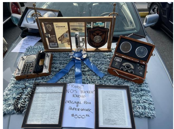
complete with Tucker memorabilia