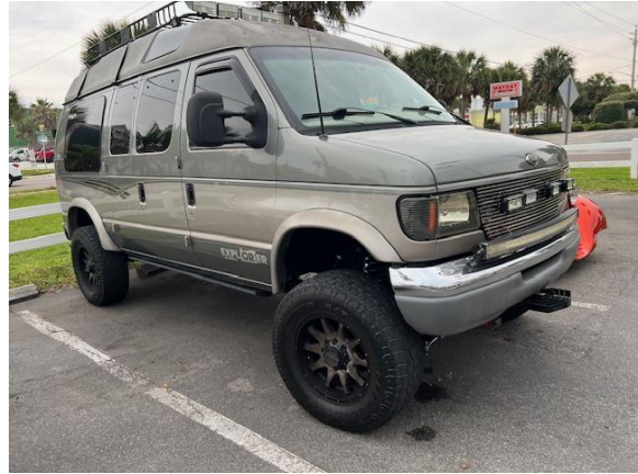
Skip Ferguson's 4 X 4 Ford Van