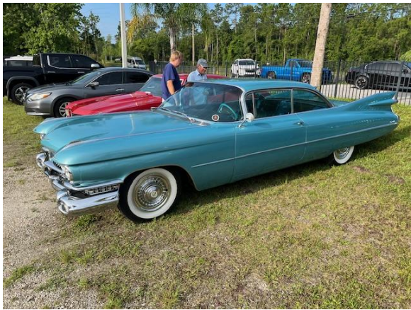
The 1959 Cadillac of Chet Svestrup