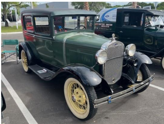
Jim Athas' Ford Model A