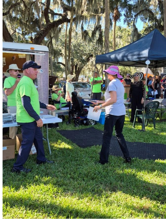
One of the Top 30 winners