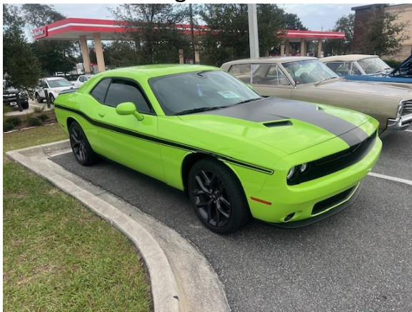
Ed Downing 2023 Dodge Challenger