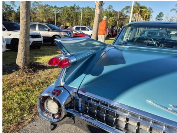
The best fin of the ‘50’s