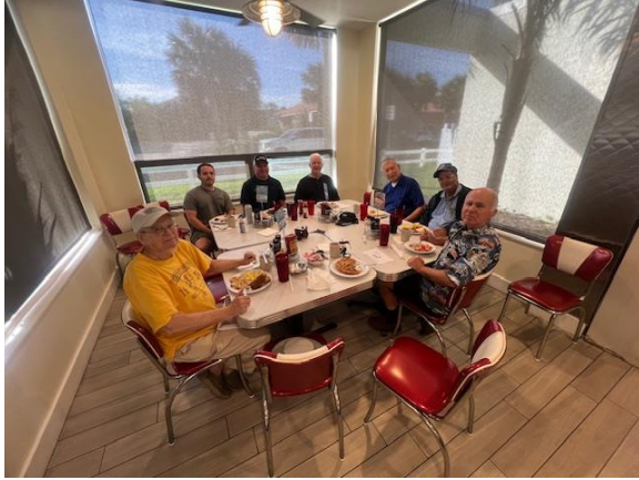
The "Old Guys"