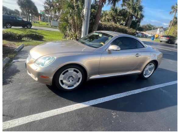
Joe Greeves Lexus SC 430