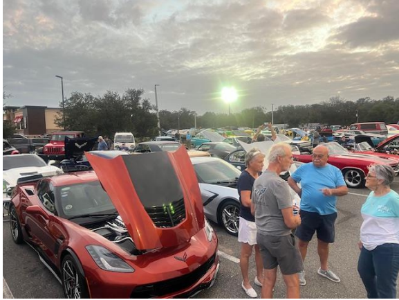
Talking about cars