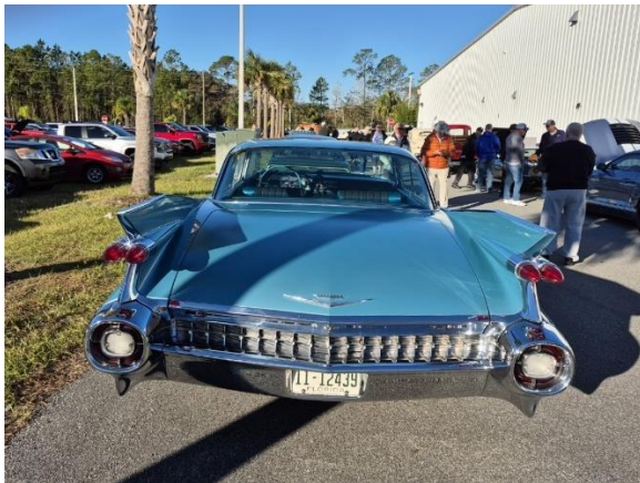
It looks just as good going as it does coming