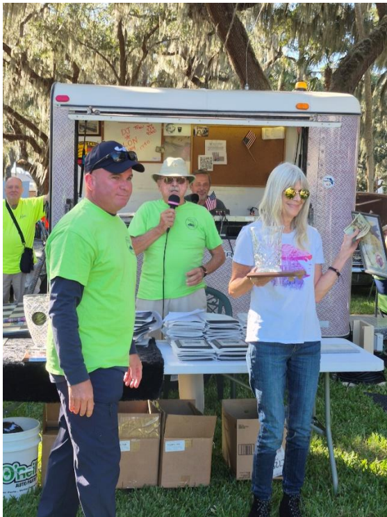
Bad Ass Car Club of Flagler County won the car club award