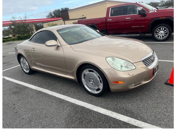
Joe Greeves Lexus SC 430