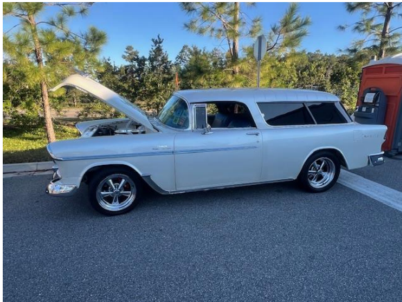
Skip Ferguson's Nomad