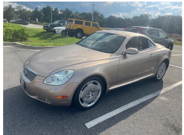
Joe Greeves 2000 Lexus SC 430