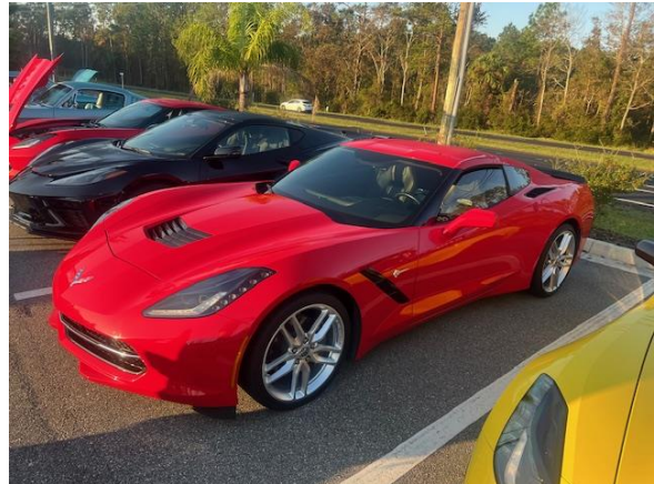
Jimmy Pucci 2018 Corvette Stingray