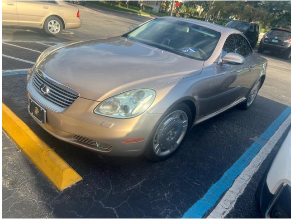
Joe Greeves Lexus SC 430