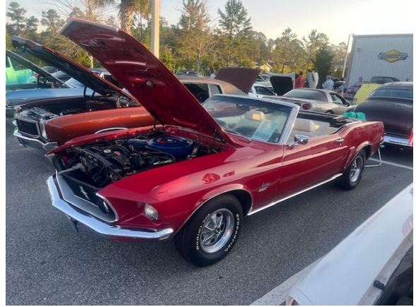
Chris Zima 1969 Mustang convertible