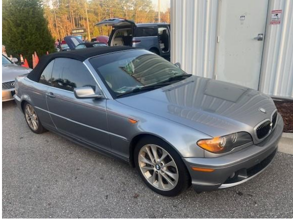
Ron Leone 2004 BMW convertible