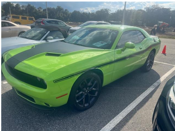
Ed Downing 23 Dodge Challenger