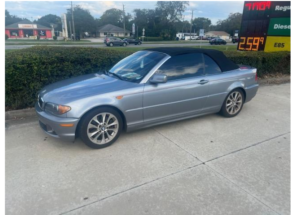
Ron Leone 2004 BMW 330