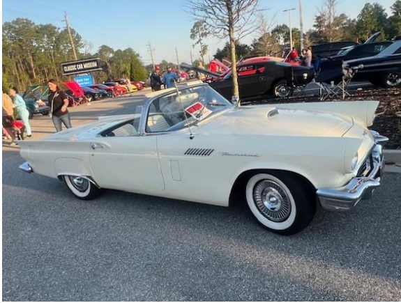
Pete King 1957 Thunderbird