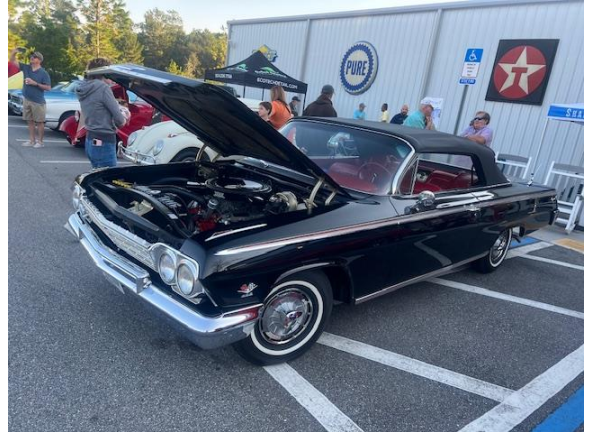
Chris Koch Chevrolet 409 convertible