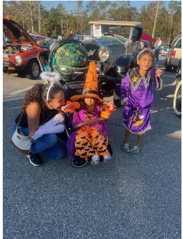
Trick-or-treaters were at the (almost) Halloween event.