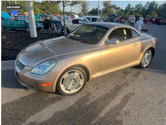
Joe Greeves's 2004 Lexus SC 430