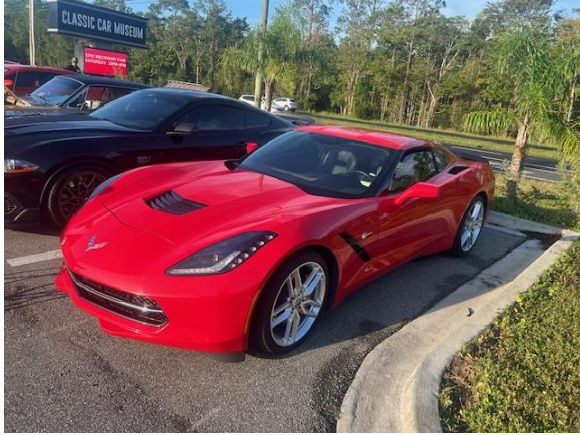
Jimmy Pucci's 2018 Corvette stingray