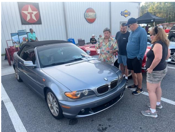
Ron Leone's 2004 BMW 330 convertible