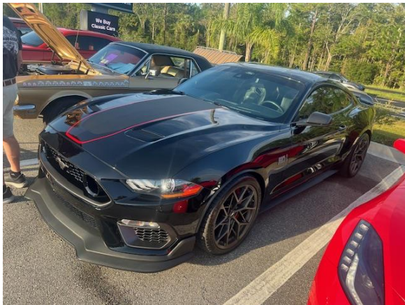
Russell Pucci's 2022 Mustang Mach 1