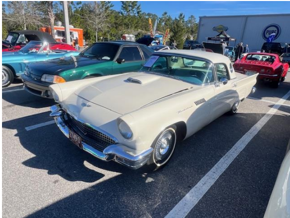
Pete King's '57 Thunderbird