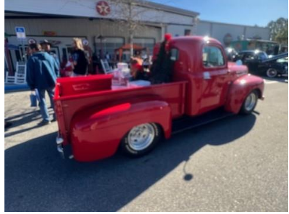
The little red Christmas truck