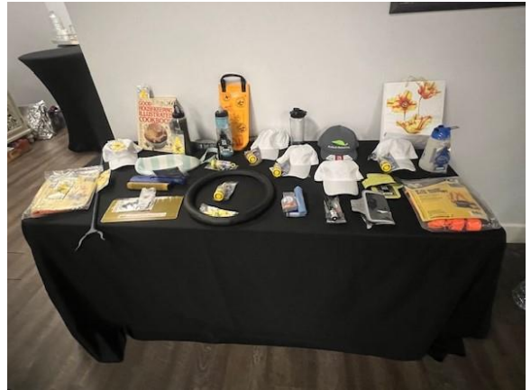
The Grab Bag table