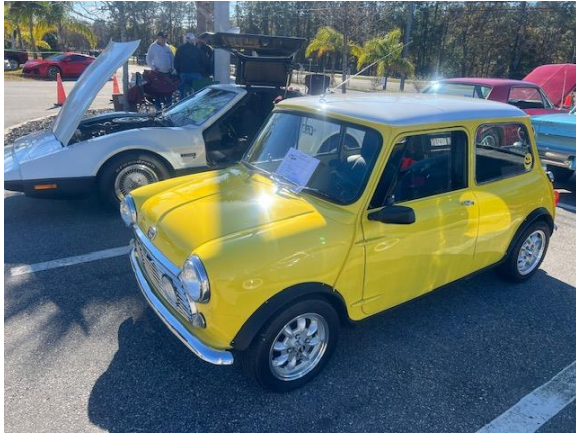
Marc Blasser's '61 Austin "Lamar"