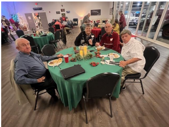
Members at their tables