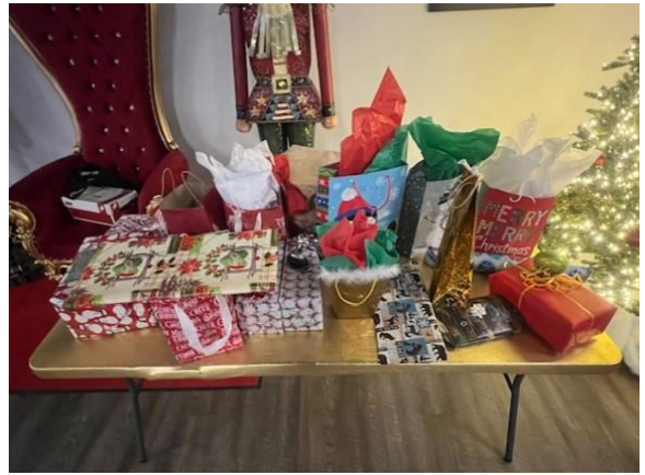
The White Elephant gift table