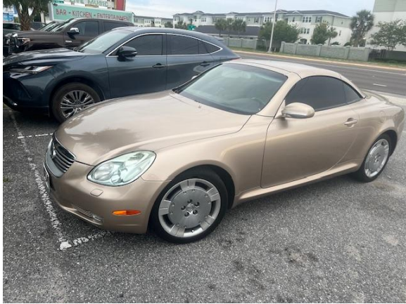
Joe Greeves's Lexus SC 430