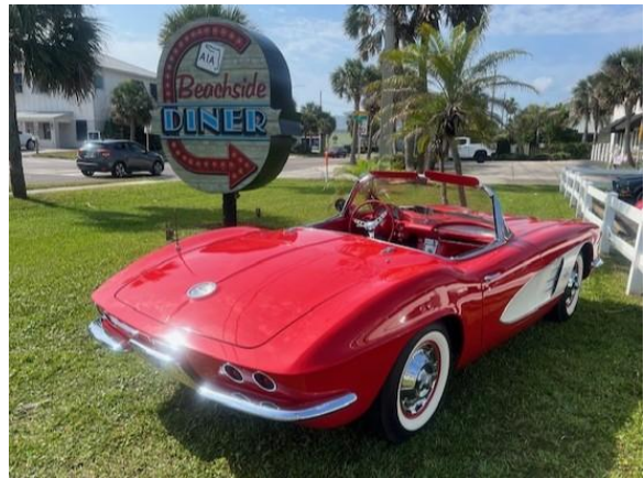
Bill Soman's classic Corvette