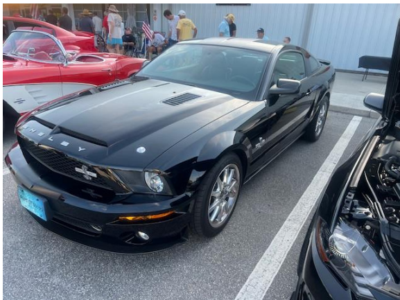
Kevin Brooks' Mustang GT 500 KR