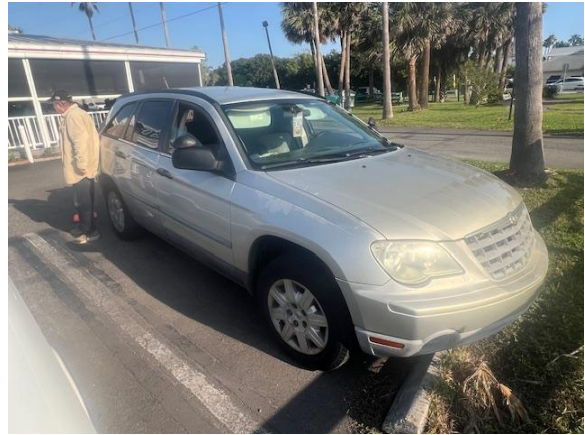
Paul McCarthy Van