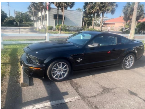
Kevin Brooks, Mustang GT 500 KR Coupe