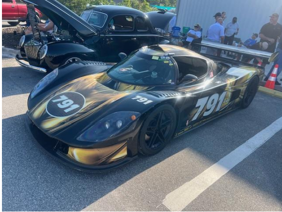
The Superlight SL-C is fast!