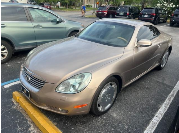
Joe Greeves' Lexus SC 430