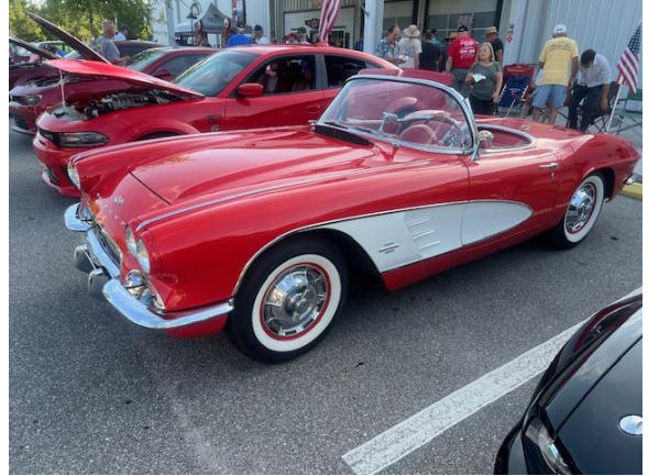
Bill Soman's classic Corvette