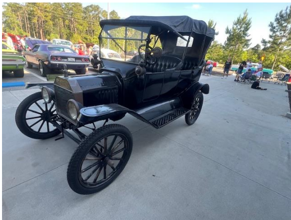
The Model T is truly a historic vehicle

mph downhill. In the front row was a Superlight SL-C with a window sticker advertising 215 mph! Its high-performance mid engine and race-derived chassis puts it in a class by itself. These two ground breaking vehicles depict the amazing journey of the modern automobile, presented to you here in sunny St. Augustine along with free doughnuts!