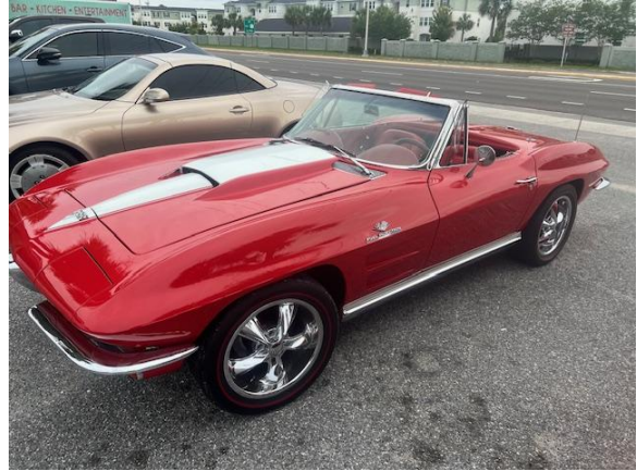
David Cameron's classic Corvette