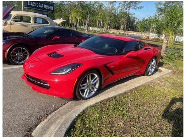
Jimmy Pucci's Corvette stingray