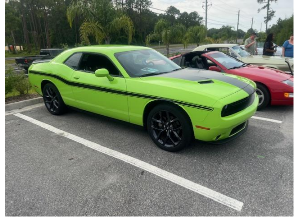
Ed Downing's Dodge Challenger