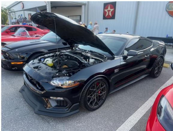
Russell Pucci's Mustang Mach 1