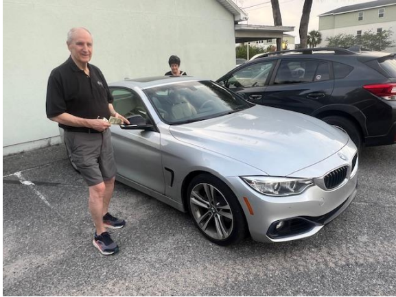
The Wirz's BMW