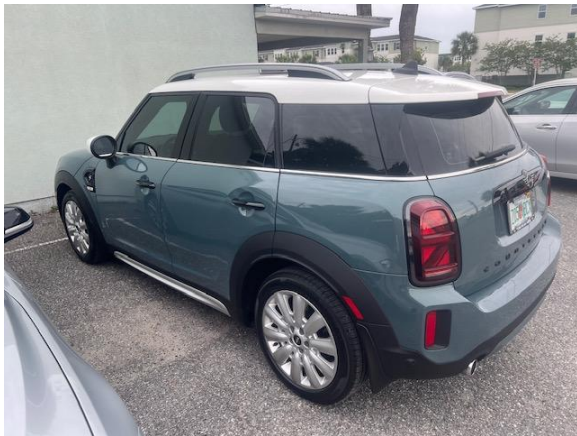
Tempa Pleker's Mini