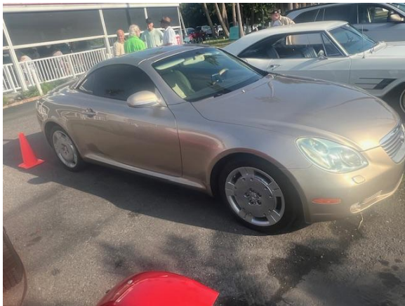
Joe Greeves Lexus SC 430