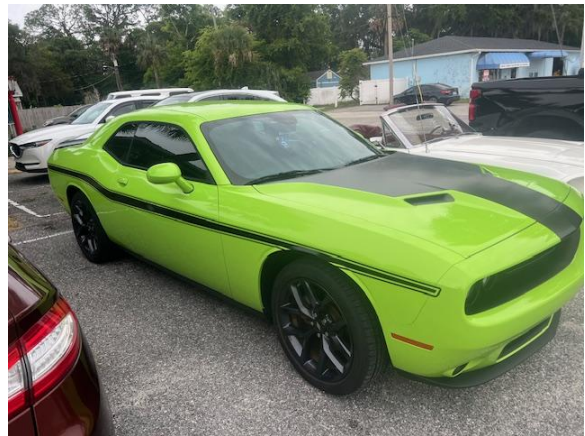
Ed Downing's Dodge Challenger