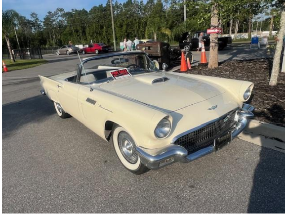
Pete King's Thunderbird