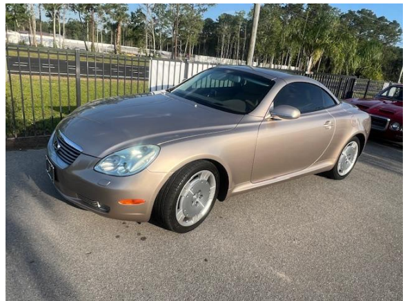
Joe Greeves' SC430