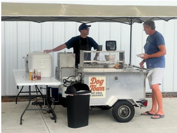
Dinner for the crowd