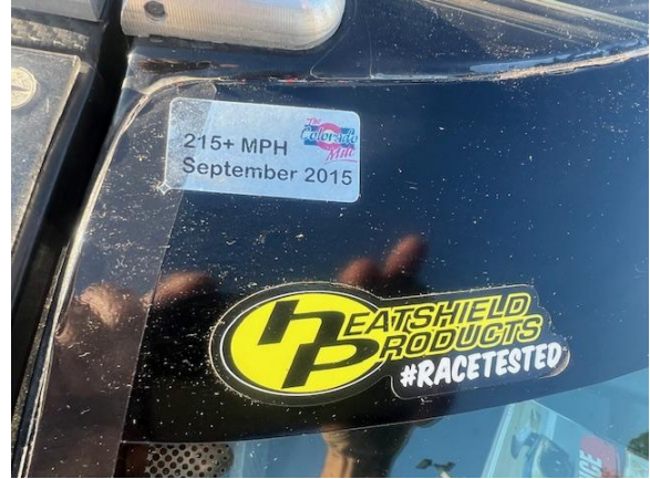
Check the window sticker.