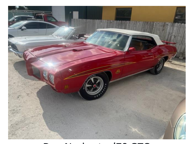
Dan Norbert - '70 GTO