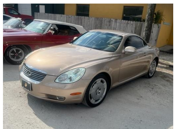
Joe Greeves – '04 Lexus SC430