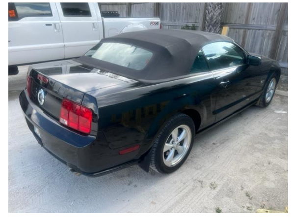
Dick Hewitt – '07 Mustang GT