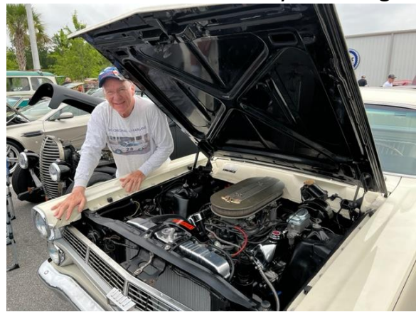
We all like to show what's under the hood!

The list of Up Coming Events is distributed separately every Monday.