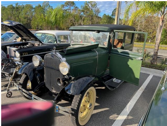
Jim Athas's Model A