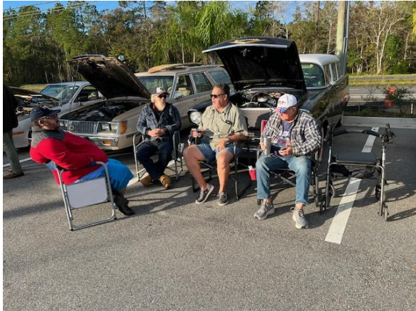
Paul McCarthy's Chevy wagon