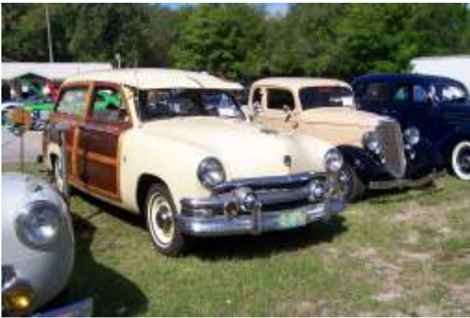
Bob Quackenbush 1951 Ford Woody Station wagon