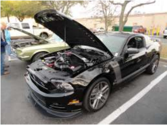
I think this is a new Mustang.