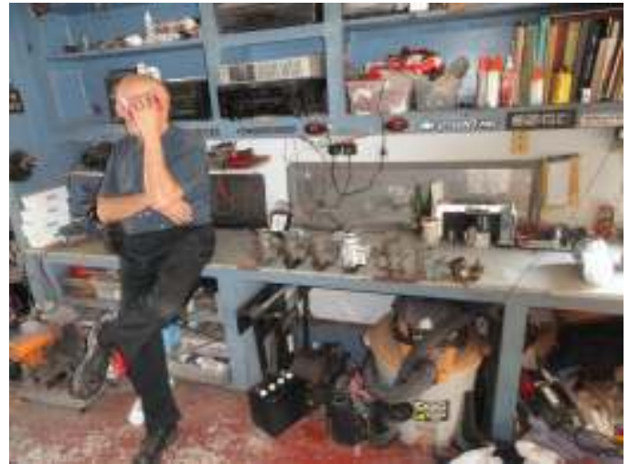
How many carburetors does it take to fix a '39 Ford?