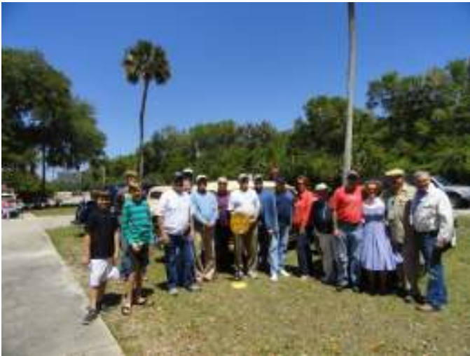
Here is the gang that went to Hammock Beach Baptist Church. Everyone was smiling.