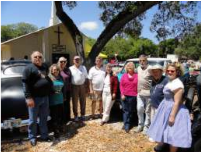
Our sister club, the St. Augustine Cruisers also had a contingent of happy participants.