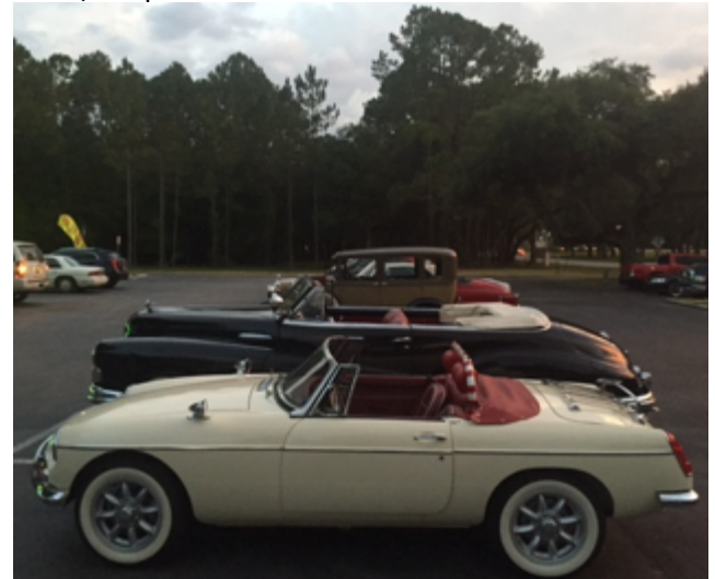
Burrows, Quackenbush, Porter, Arpaia