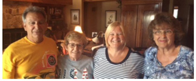
More happy faces.