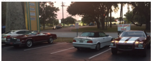
Nietzel, Leone, Steinberger – nine cars, seven convertibles! Beautiful night for wind in your hair!