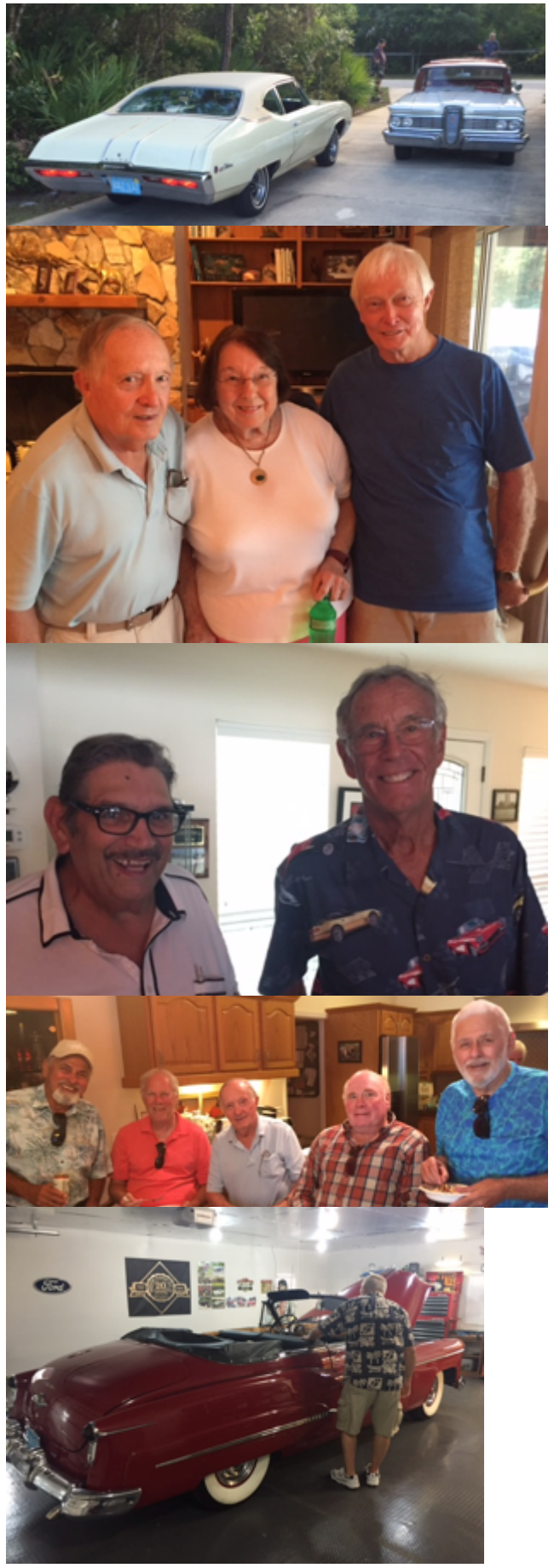
Another beautiful car-Many happy s mile s ...