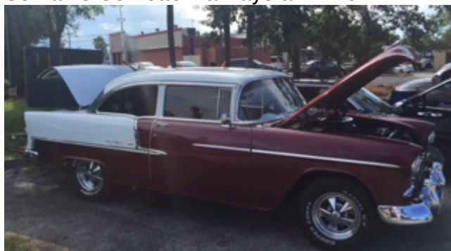
Double Nickels Chevy-super nice.