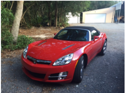
Other cars joined the celebration.

The Lincoln, banished to the outdoors waits for the celebration to conclude.