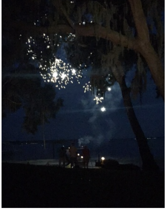
Fireworks at Sherrod's 7-4