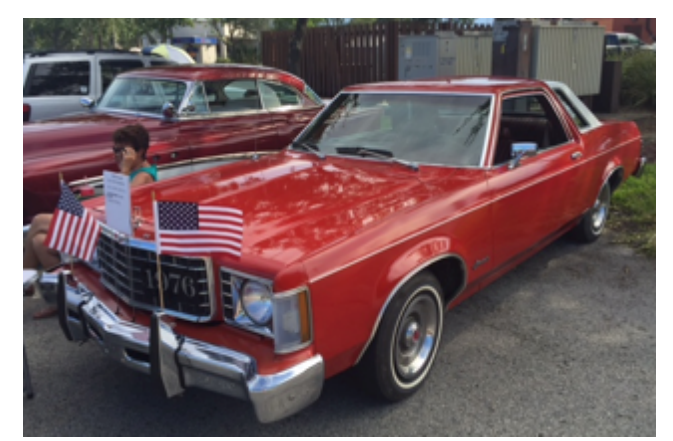
Patriotism runs high—1976 Beauty!