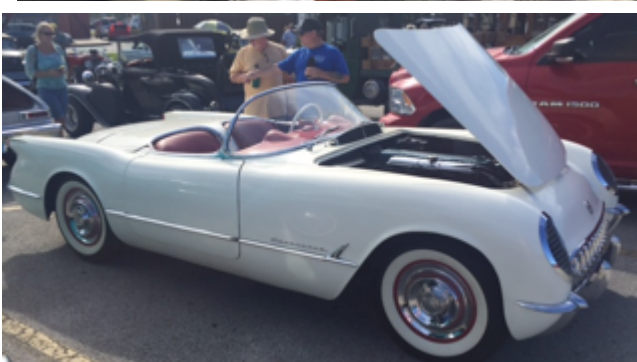
Soman's Corvette-always a winner!