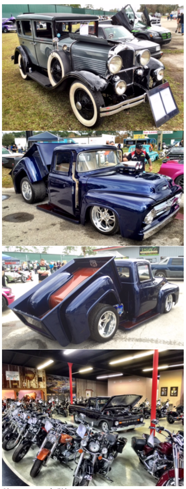
Showroom at FX.