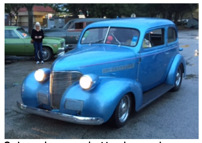
Rainy days and Mondays always make me blue.