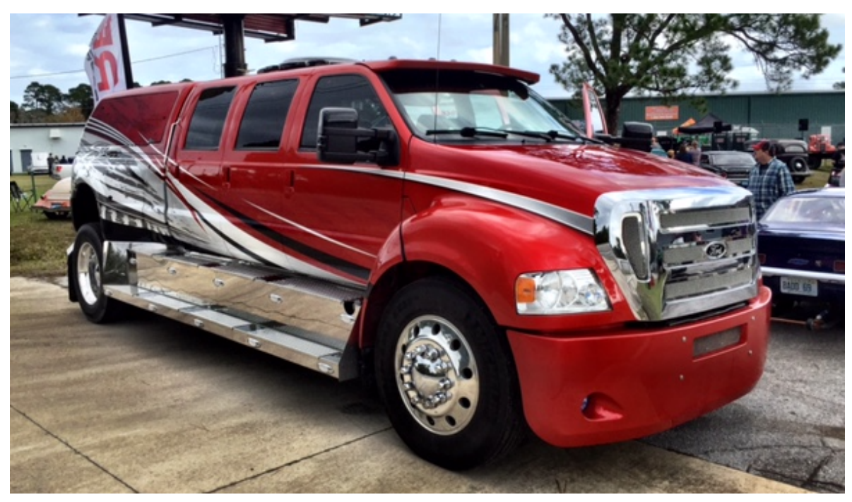
Visual FX Show—January 16—Benefit Tara Richardson—here are some great photos of the cars provided by Joe Greeves: