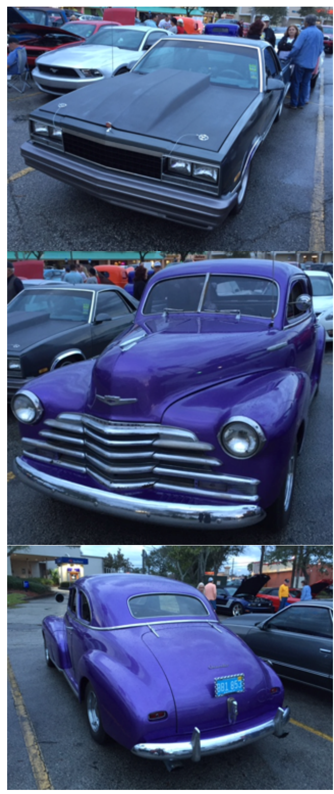
or purple. Check the activities list for the next Cruise-In-3<sup>rd</sup> Saturday each month 5 p.m. - 7:30 or so.