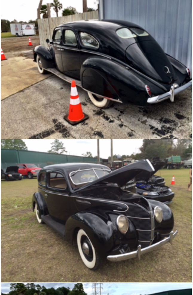
A field day for beautiful cars! The next one's purple.