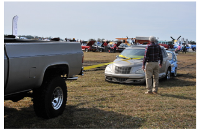
Where there's a will, there's a way.