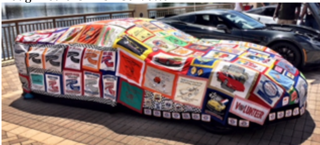
I guess that covers it.