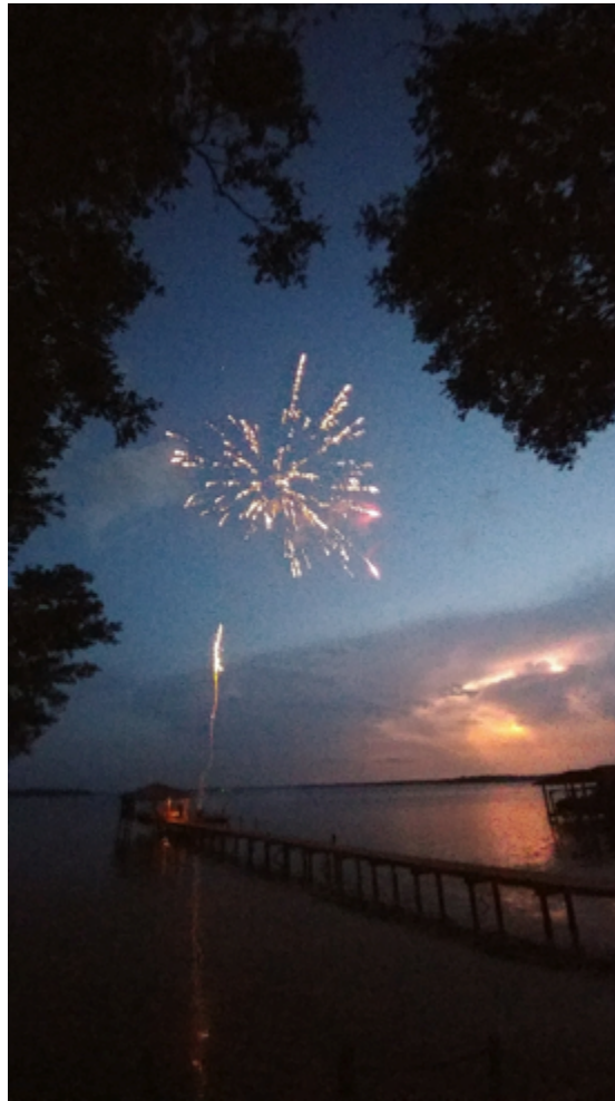
The club is sponsoring this event; food and fireworks.

Next Meeting at Sherrod's July 5-- Fireworks start at Dusk and last 35-45 minutes. Barbeque before fireworks!