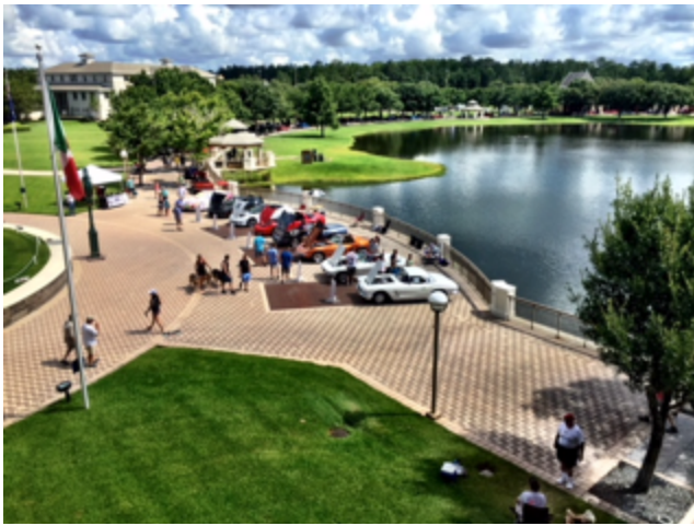
Aerial view of Corvettes at World Gold Village