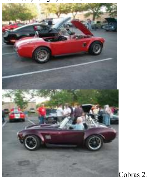
It was exciting!