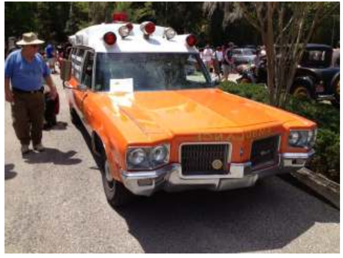
Some of you know my ambulance story—so this beauty from Palatka caught my eye.