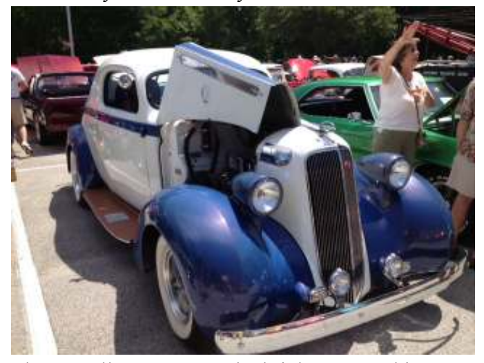
The Castellanos were parked right next to this pretty entrant.

As you can see, there was plenty to do, plenty to see. I'll send the photos of Carley with the cover letter—my camera decided to make both photos movies, and I don't think they will print here.