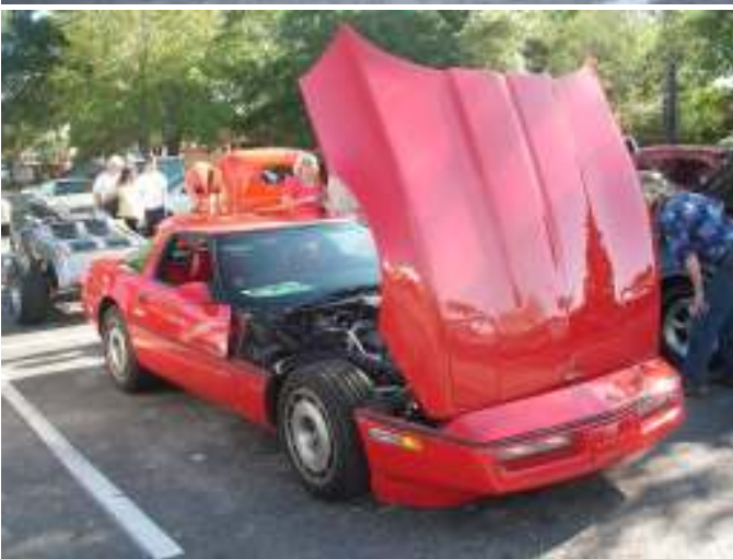
This car was also for sale.