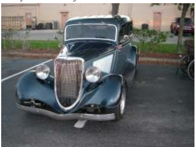
Becky's VW—She just loves VW's!!