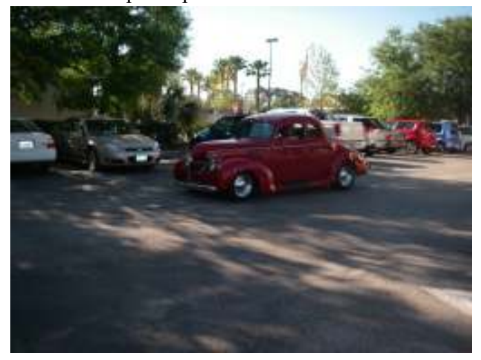
Don't you just love red cars!!!?