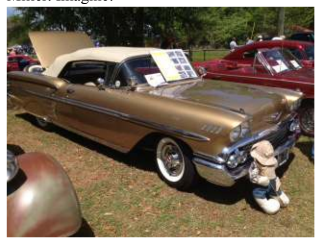
Pretty '58 Chevrolet.