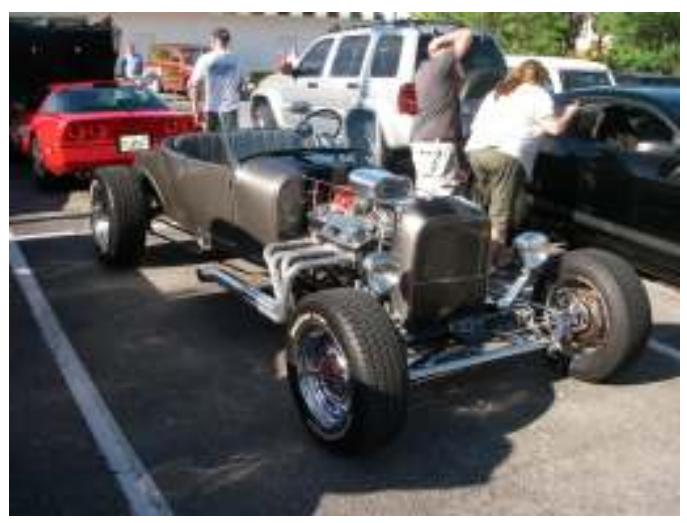
'27 T Bucket