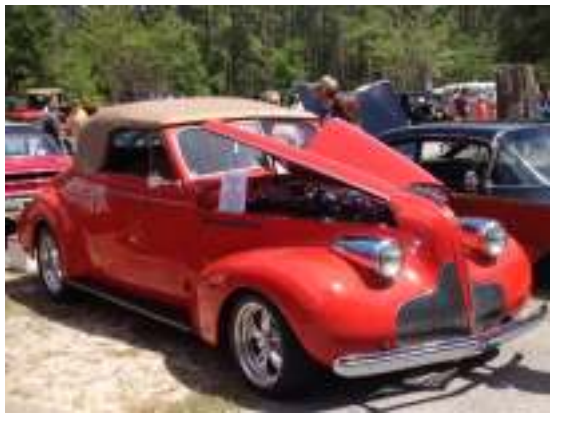
What can I say—It's beautiful!