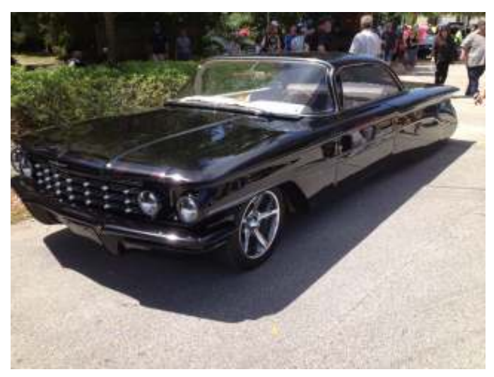
This Oldsmobile was the longest car there. It was hard to get it all into the photo.