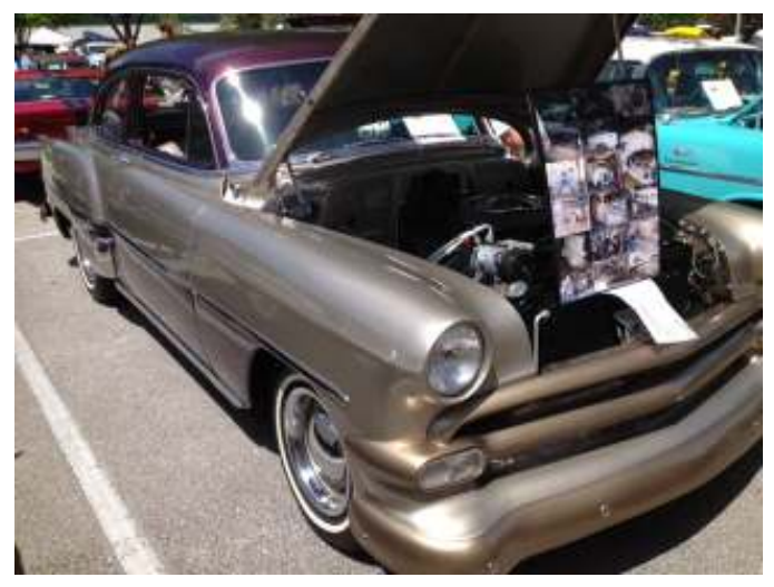
Do you recognize this car from the Rodeheaver show?