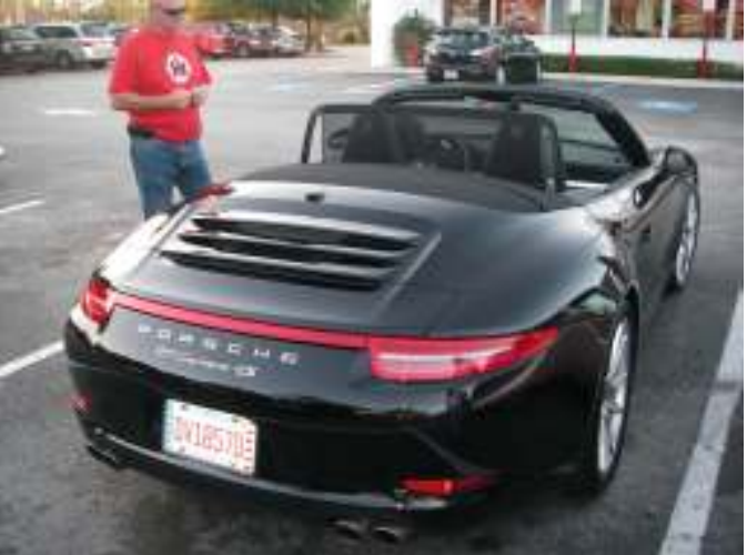
Did I mention that it was black?