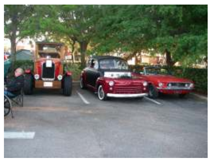
Cruiser's Corner—D'Agostina, Wrisberg, Wynne