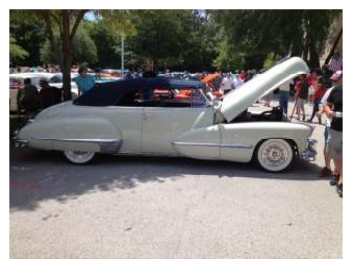
This Caddy was one of my favorites!