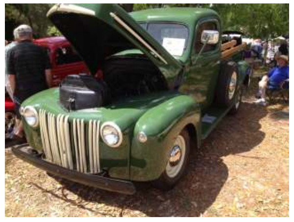
Plenty of trucks.