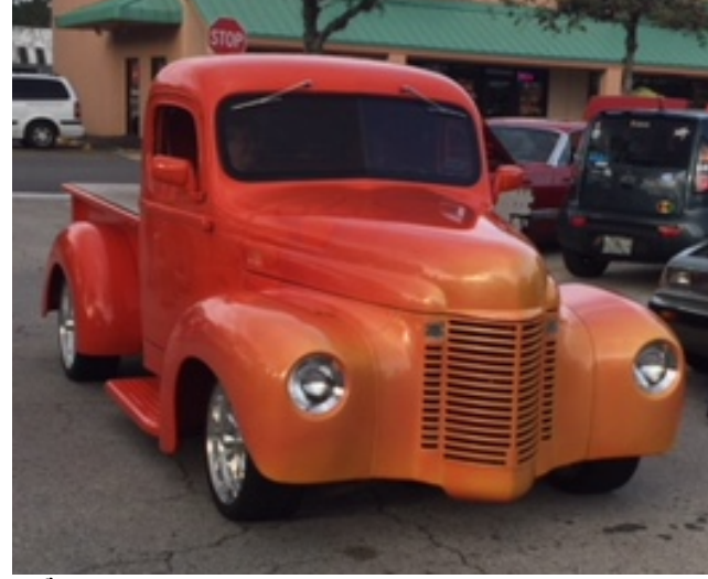
If you don't get there early, you're late!