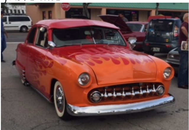
Orange U glad!