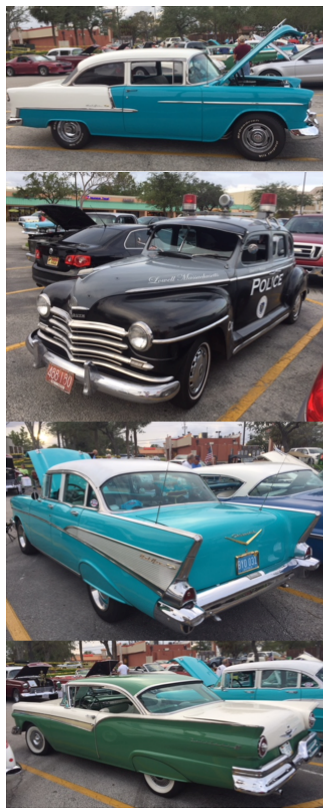
You have to stand well back to get the whole car in. Dewey's '57 Ford! See y'all next month!