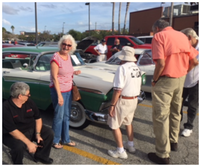
Here we have the long and the short of it!