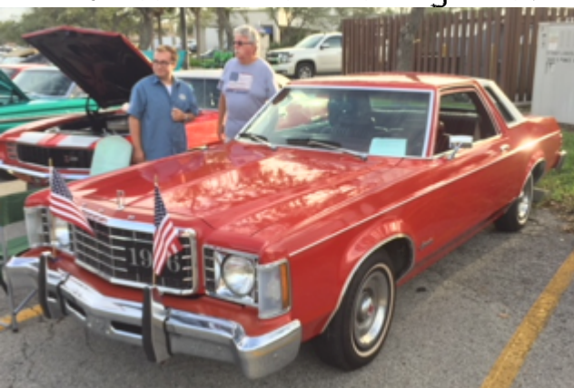
Flags on car and shirt!