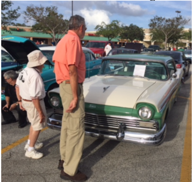
Pretty remarkable, eh?

(I think it used 56 qts. of oil on the way down.) (right)---