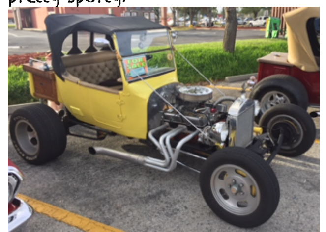
Here's your chance; I'm for sale!