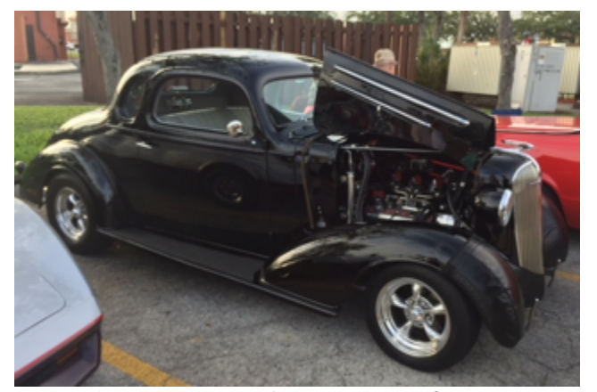
Sun shines on Black Beauty.