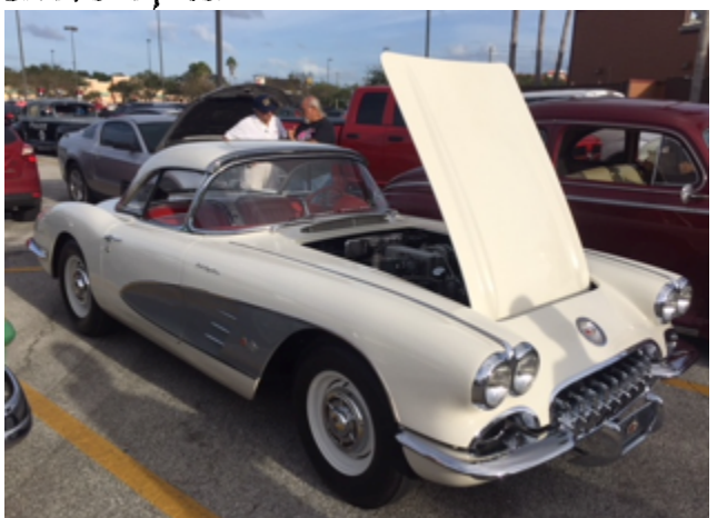
Salanitri's Cool Corvette again!