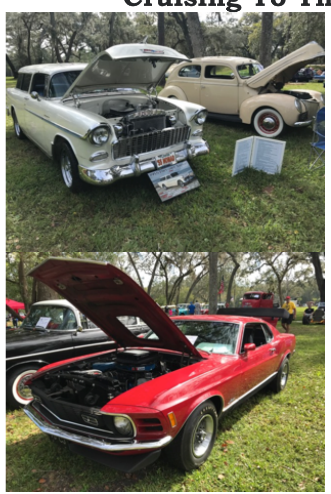
Cruising To The Creek

October 7 8 members of ACAC enjoyed the car show at Trout Creek. Here Dewey Porter is surrounded by another kind of beauty among the pretty cars!