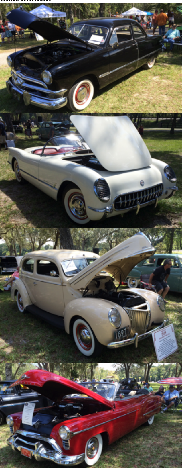
Emerys, Somans, Hunsworths, Arpaias showing off beautifully for ACAC. All get blue tickets for participation. Thanks to all who helped put Olde News together! Jinny