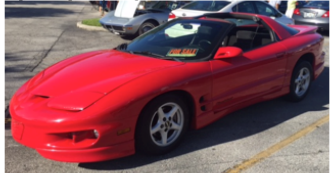
2002 Firebird was offered for sale for $6000.