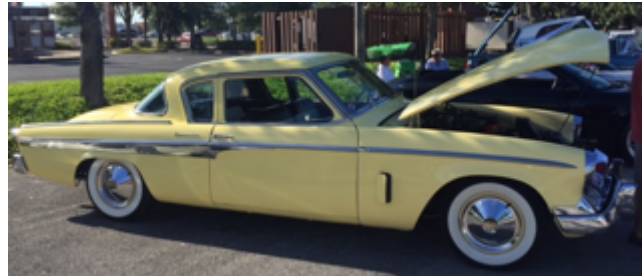
This yellow Studebaker shines bright!

Cary Weisenbaker always does a good job of keeping the laughs flowing and fun happening. It looks like he's in the dark, but looks are deceiving. Here are a few of the beautiful cars that were there.