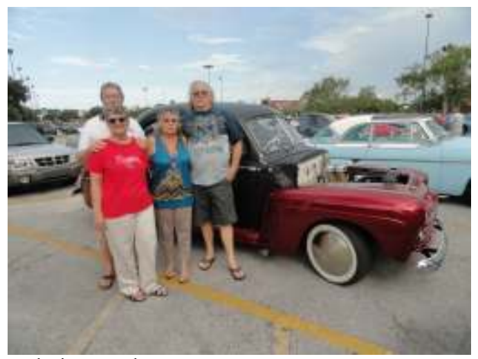
and nice people.