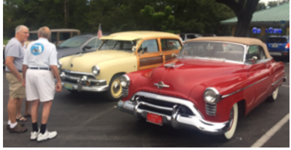
Another double pair of good-looking iron and men.