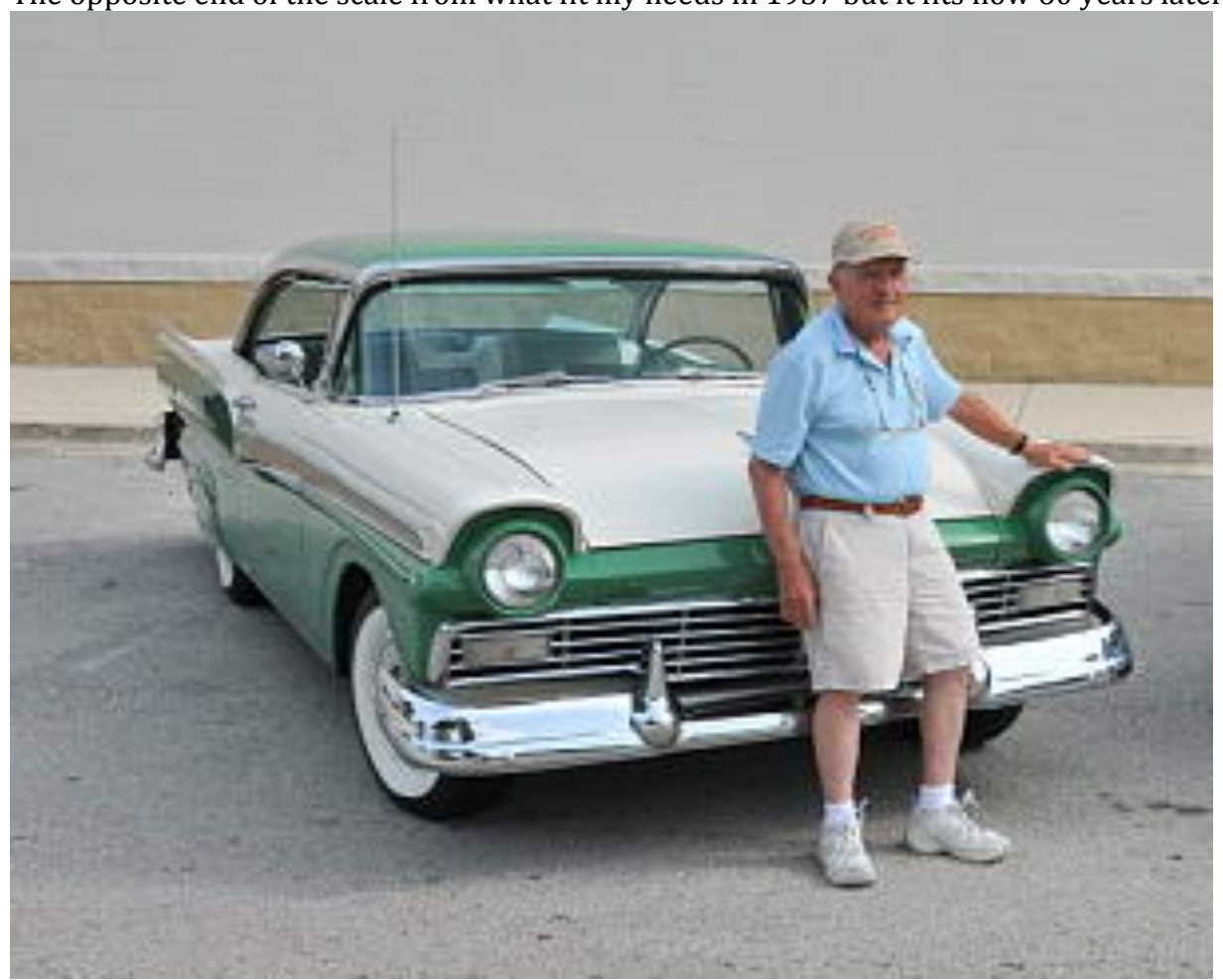
1957 FORD FAIRLANE 500 VICTORIA

sent more photos and a full description and a price was agreed upon with him offering to bring the car to St. Augustine for my approval. That was in January of 2017. Since purchase I have had the paint restored, added new Coker radial whitewalls, rebuilt the brakes and am ready to drive to old car activities. It's a top of the line Fairlane 500 2 door hardtop with the 312 engine, power brakes and steering, an automatic transmission, radio and heater. The opposite end of the scale from what fit my needs in 1957 but it fits now 60 years later.