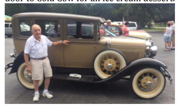
Too Too Handsome twosome.

Hot and sunny with rain clouds threatening, a typical August evening. Not to be discouraged were 15 of us driving 6 collector cars that gathered at Cheezes Grill for our meal and then went next door to Cold Cow for an ice cream dessert.