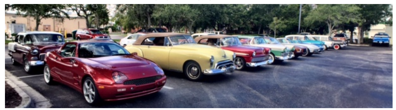
Old Guys With Old Cars August 11, 2017