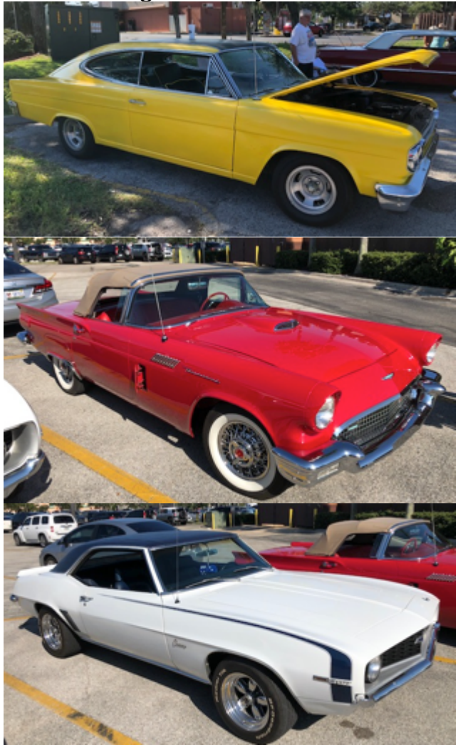
These are only a few of the great cars that congregate monthly behind Longhorn's Steakhouse. Nice night; good venue.