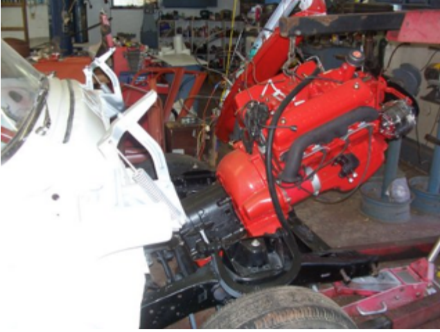
The motor has to be as pretty as the rest of the car.