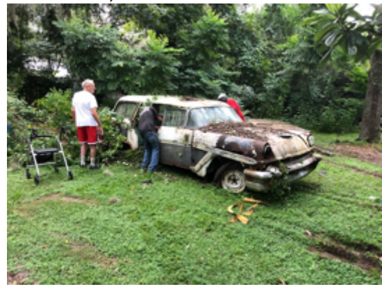
For the rest of the stor y see page 14