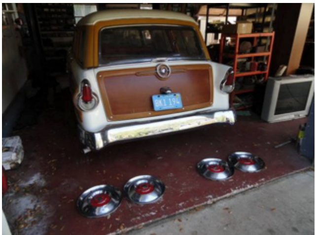
Hubcaps all lined up.