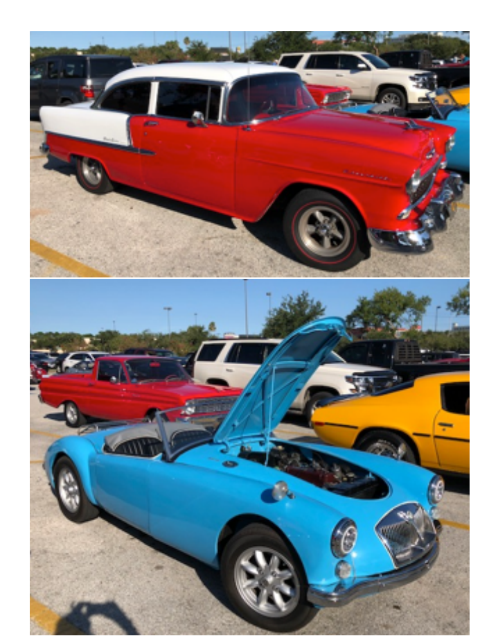
Primary colors seemed to be in order.