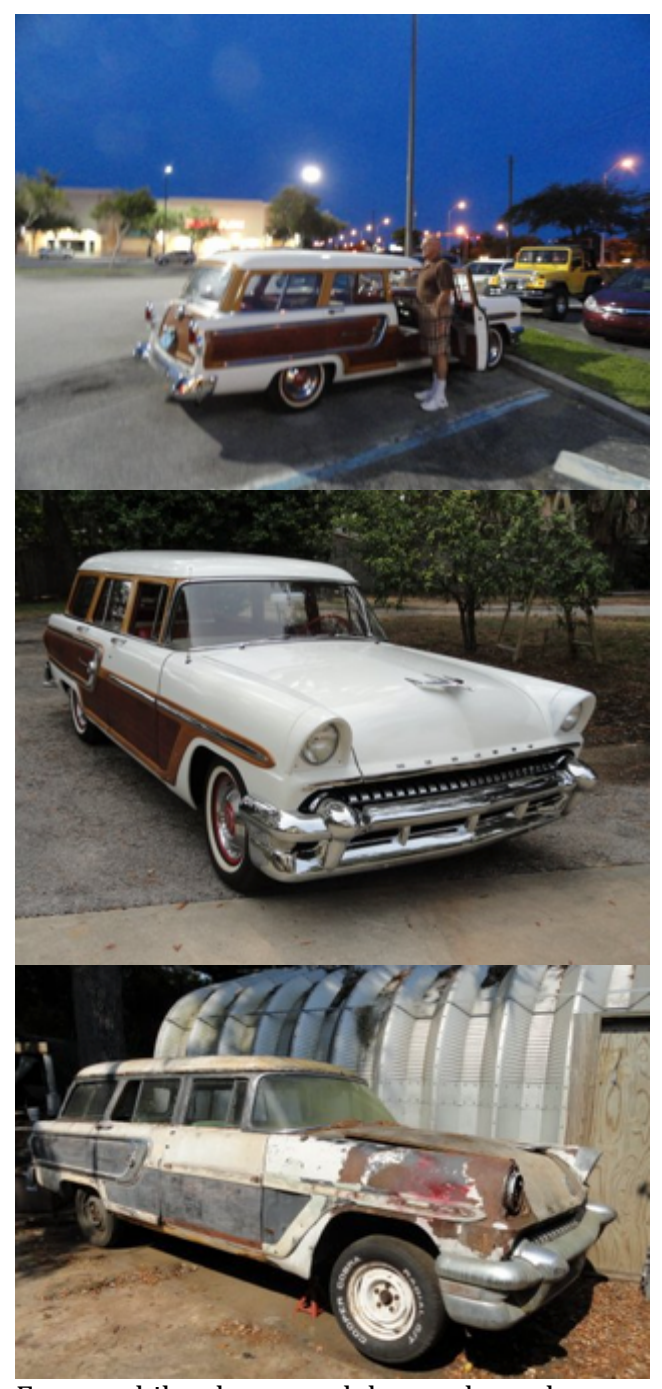
For a while she rested here; then she was placed along the fence lines to face the hurricanes, etc. on her own.