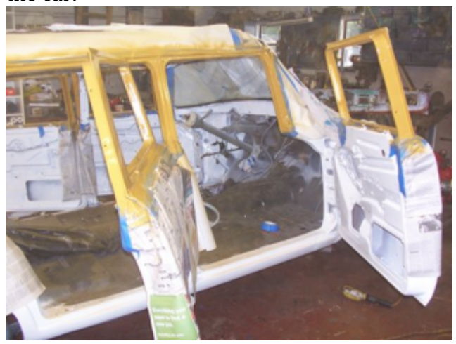
Ready for wood graining.