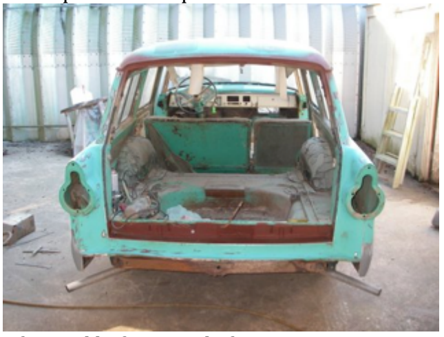
After and before! And after.