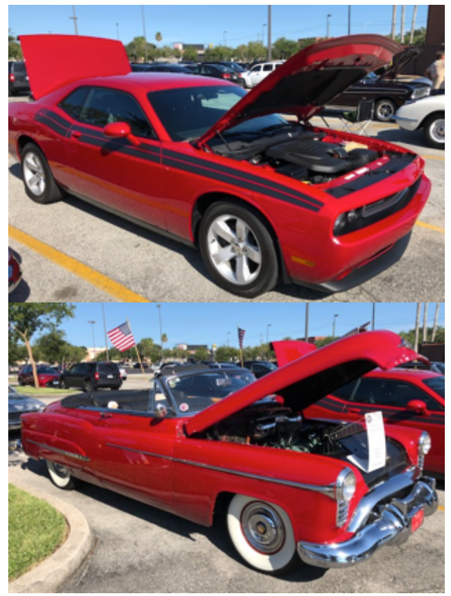
Always lovable—Arpaias's Oldsmobile