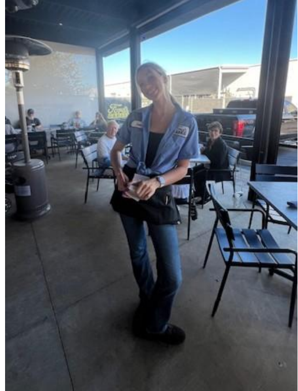
Tabby, our personality-plus waitress