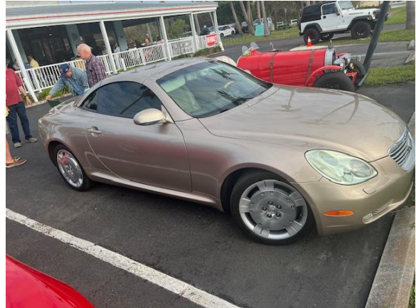
Joe Greeves Lexus SC 430