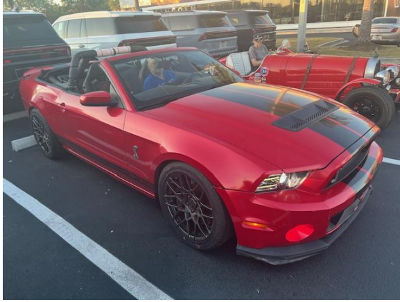
Bill Marshall's Mustang race car