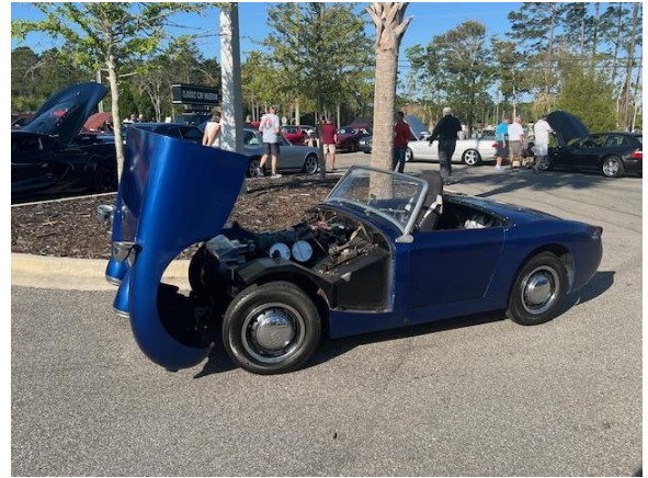
Austin-Healey Sprite with easy access to the motor