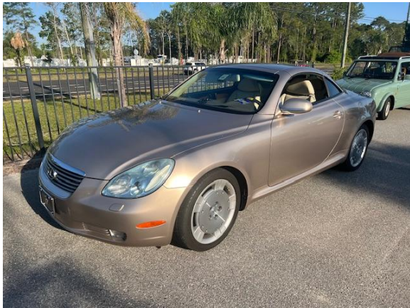
Joe Greeves Lexus SC 430