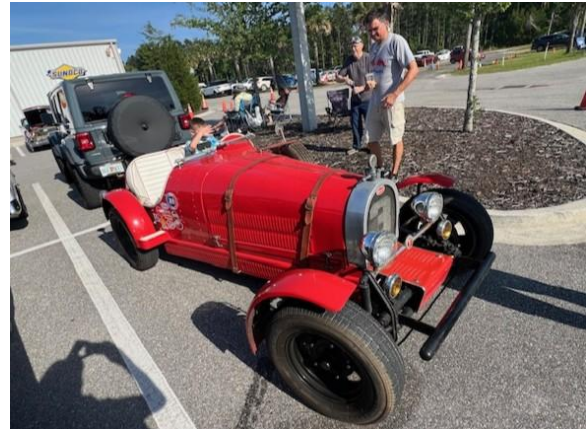
Built McCaw's attention-getting Bugatti replica