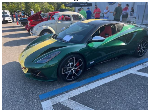
A rare Lotus on display