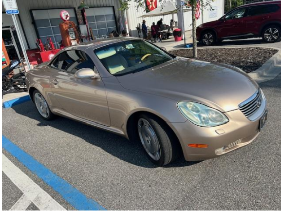
The Lexus SC 430 of Joe Greeves