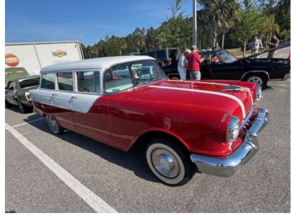
Carly King's red and white Pontiac wagon.