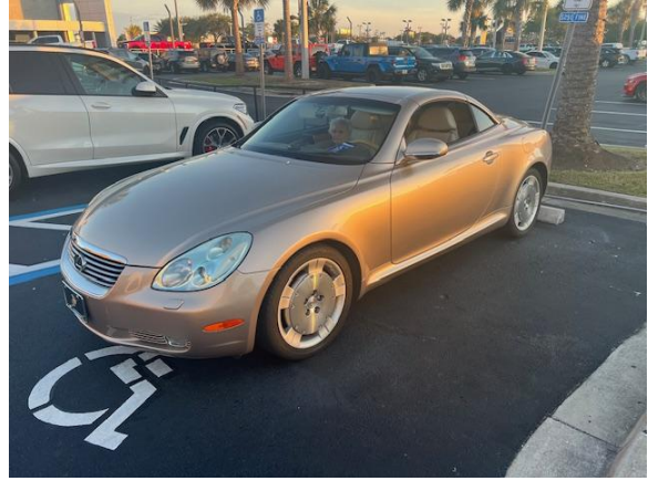
Joe Greeves Lexus SC 430