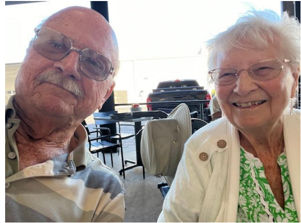
Your club photographer and his lady. He's the guy usually behind the camera.