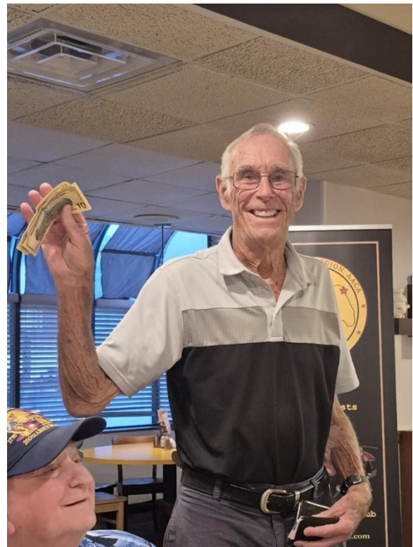
Bill won the 50 / 50