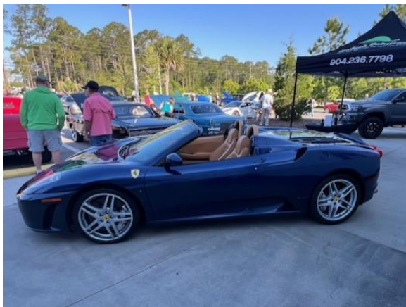
High dollar Ferrari convertible