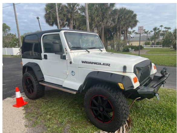
Paul McCarthy's Wrangler