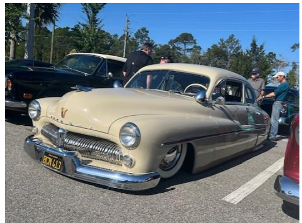
Slammed and chopped, this is a perfect example of a Mercury lead sled.