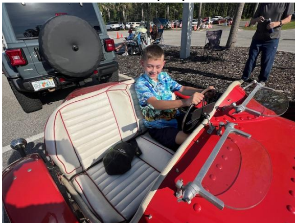
A new convert to the hobby