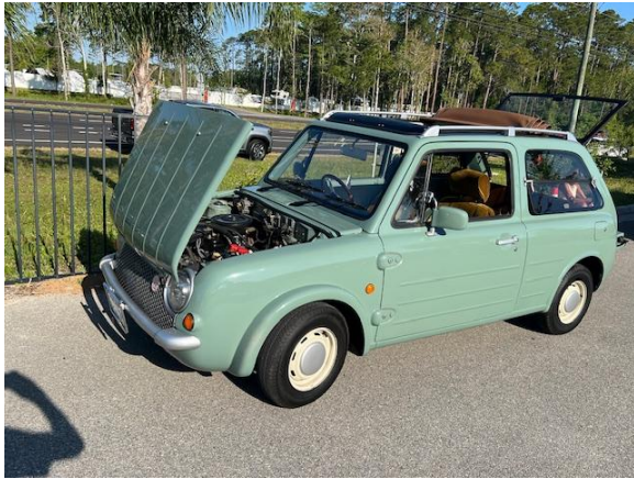
A tiny Japanese Pao

No matter what brand you favor, there is something for everyone from a tiny Japanese Pao and a miniature Austin Healey Sprite to a fire breathing Ferrari and a classic Mercury lead sled.