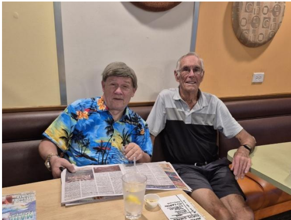
The Overflow Table