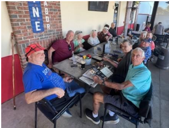
More of the group at the long table