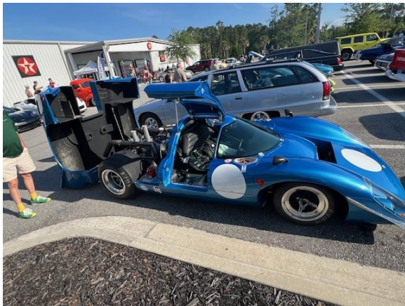
Check out this high performance Lola on display