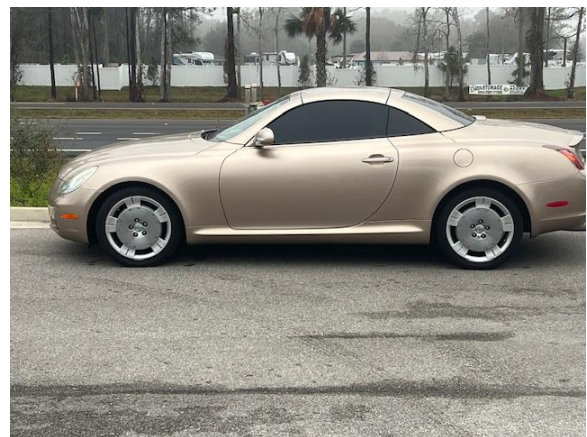
Joe Greeves's 2004 Lexus SC 430