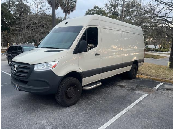
The 'portable garage' of Jeff Dougherty