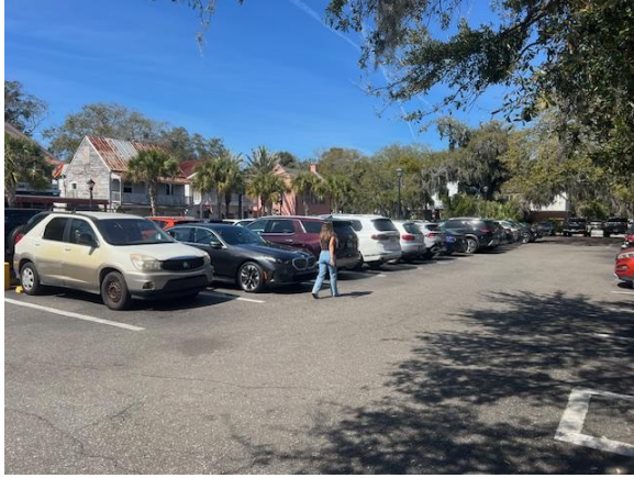
Having a place to park on St. George Street is a real advantage.