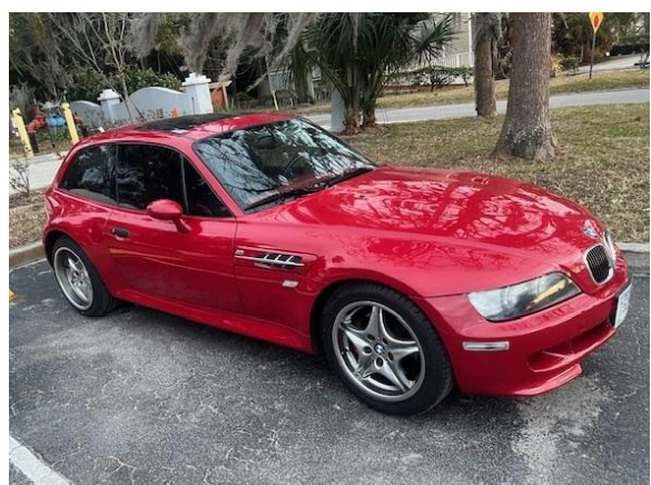
Tim Wing's BMW "Clown Shoe"