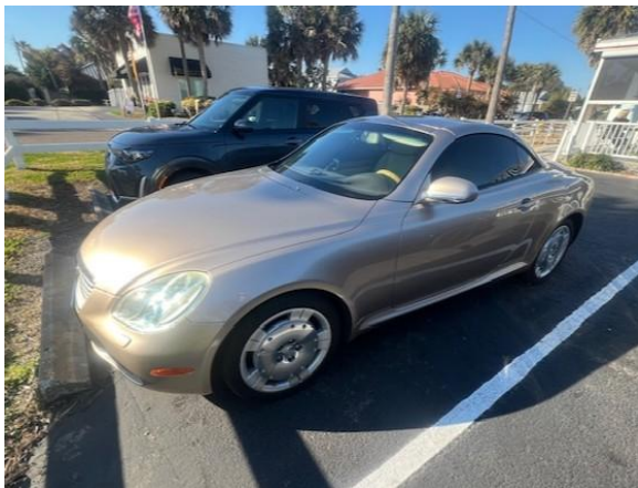
Joe Greeves, Lexus SC 430