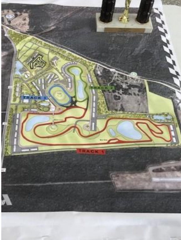
The map of the new automotive venue

Hoping for better weather, put March 28 on your calendar for the next Cars and Coffee get-together.