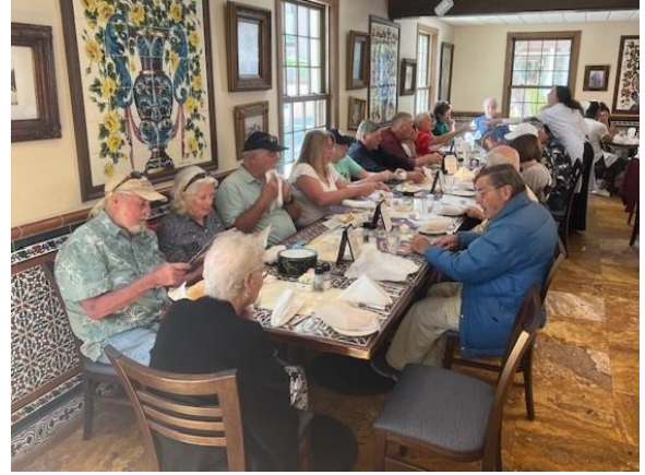
Our long banquet table held 24 members, making conversation easy.