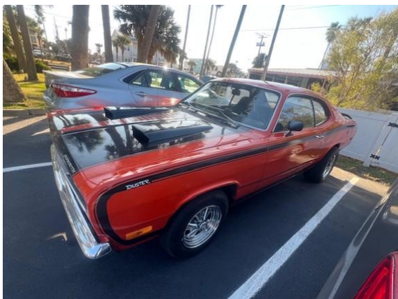
Ed Downing, Dodge Dart