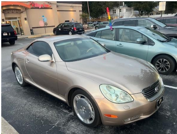
Joe Greeves Lexus SC 430