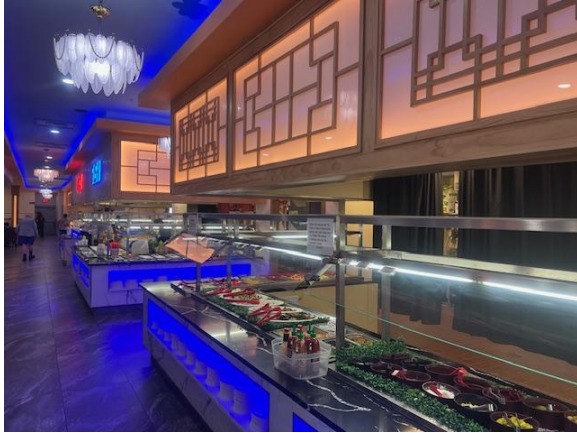
The salad bar seemingly stretched forever.