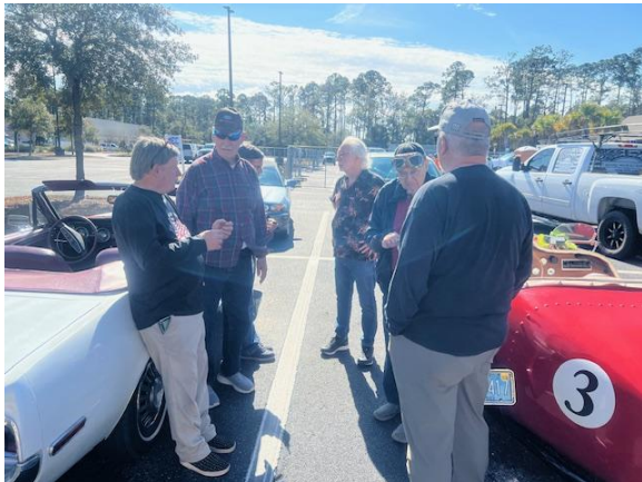
The first of many conversations began in the Walgreens parking lot.

We posed for a group shot in front of the restaurant's pink Cherry Blossom tree in the lobby, said our goodbyes, and headed home. It was a great day to be behind the wheel with friends!