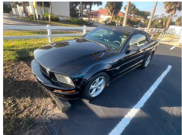
Dick Hewett's Mustang convertible