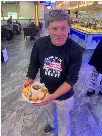
Our resident Galloping Gourmet was very happy with the selection.