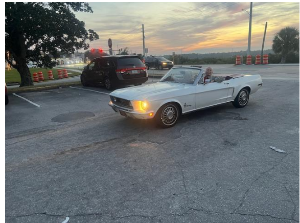
QuackenBagg arriving in their Mustang convertible