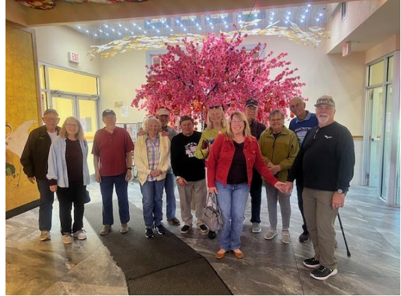
The Group in front of the pink Cherry Blossom tree