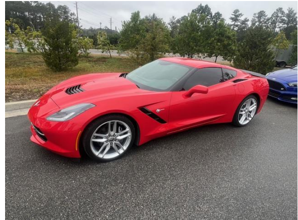
Jimmy Pucci's '18 Corvette stingray