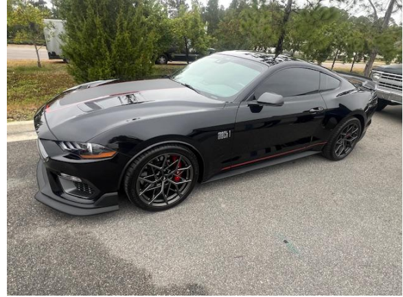
Russel Pucci's '22 Ford Mustang Mach 1 coupe