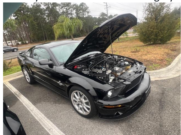
Kevin Brooks' '08 Mustang GT 500 KR