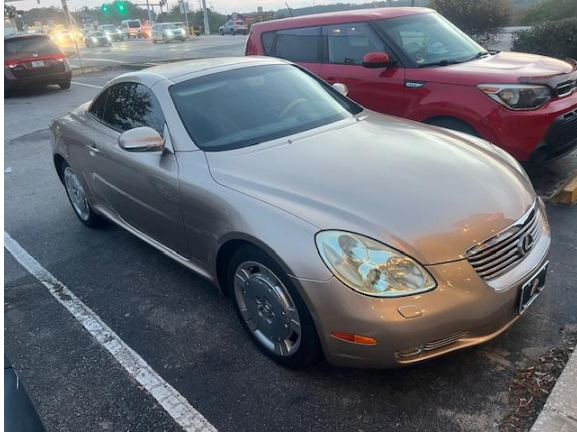
Joe Greeves Lexus SC 430