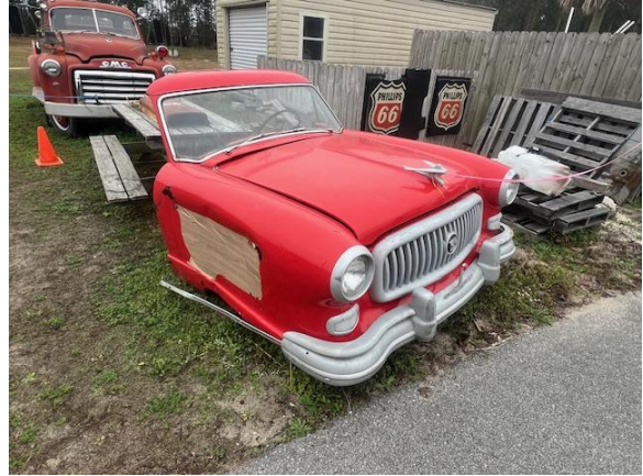
Priced to sell, Needs work!