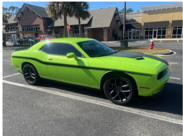
Ed Downing's 1947 Lime Green Dodge Challenger