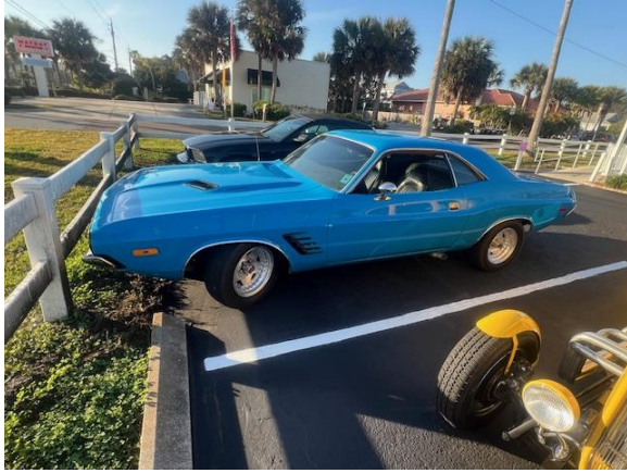
Skip Ferguson's Dodge Challenger