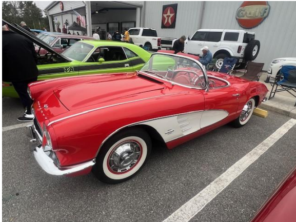
Bill Soman's '61 Corvette convertible