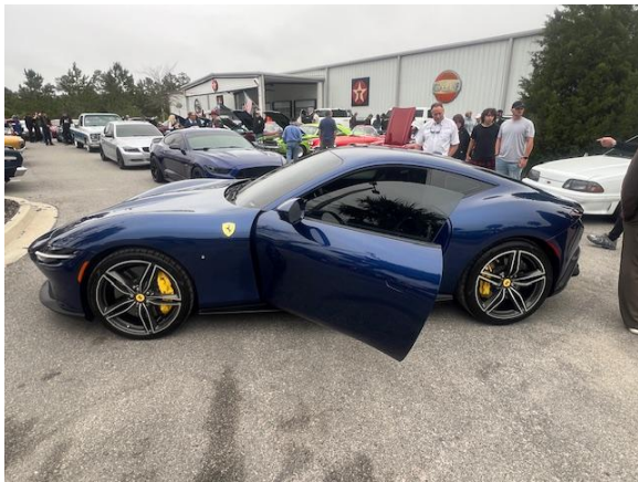
High dollar cars were everywhere!