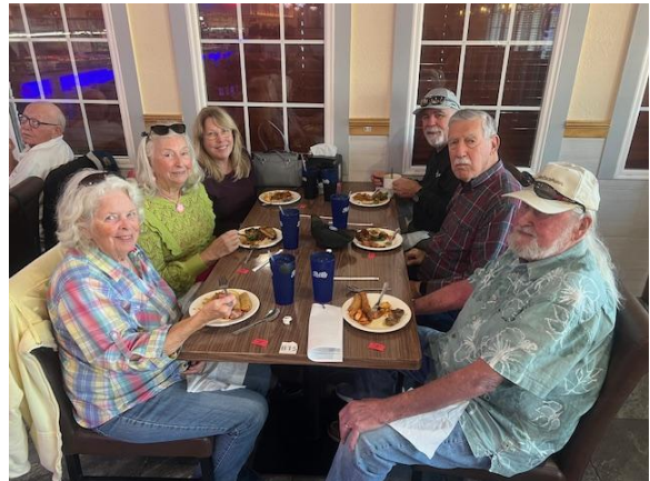
The Group enjoying lunch