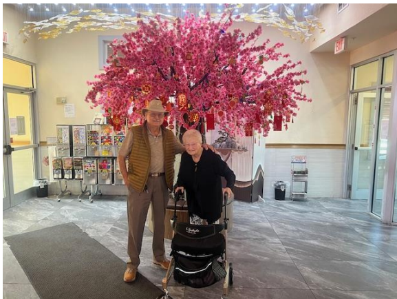
Your President and First Lady