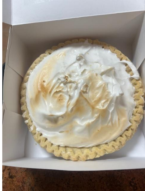
If you were one of the four lucky winners of a Village Inn whole pie certificate, this is what it looks like.