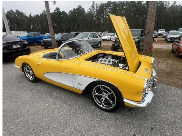
Beautiful Vintage Vette