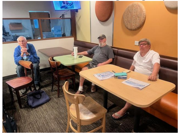
The kid's table