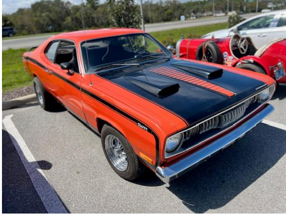
Ed Downing's '72 Plymouth Duster