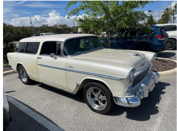
Skip Ferguson's '55 Chevy Nomad