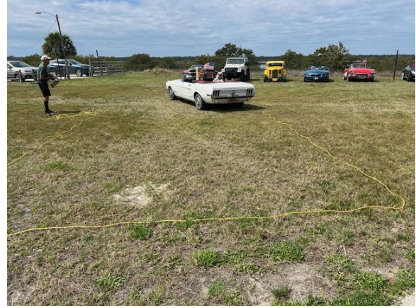
Staying between the ropes is a challenge