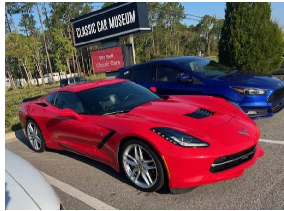
Jimmy Pucci's '18 Corvette Stingray