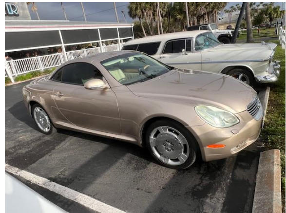
Joe Greeves's '04 Lexus Retractable