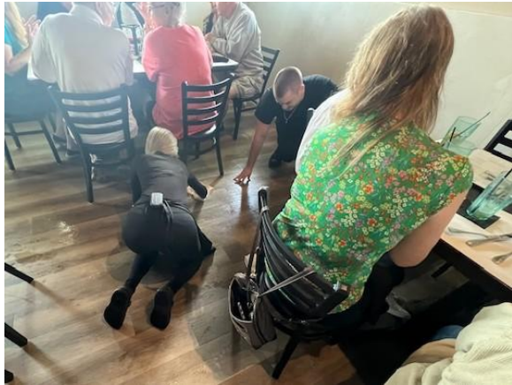
The waitress dealing with an unexpected surprise.