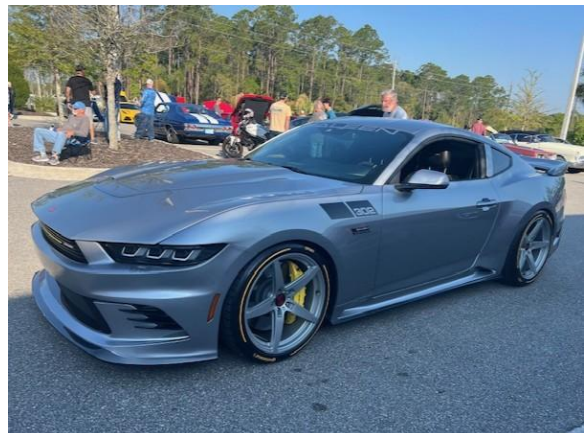
The Saleen Mustang