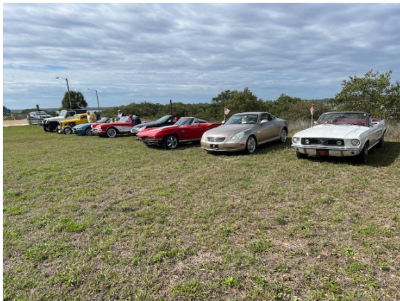
Member cars were lined up.