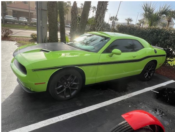
Ed Downing's '23 Dodge Challenger