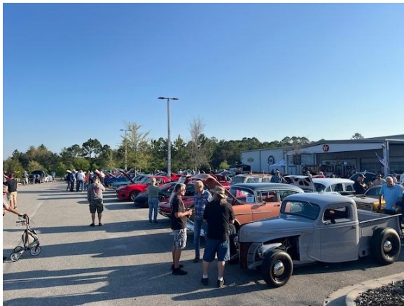
Overall Group Shot

Put April 25 on your next month's calendar and come out and enjoy your friends for an early morning, breakfast get-together.