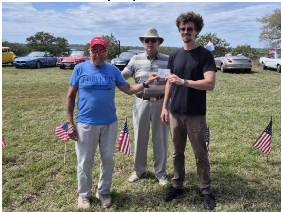
The award ceremony sent members home with gift cards.