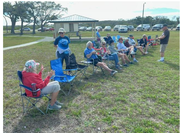
And members were too!