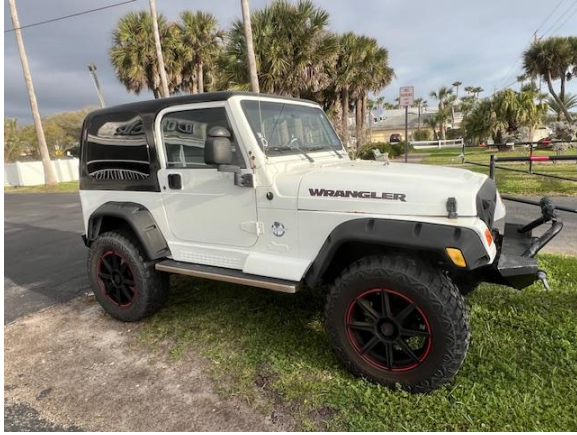
Paul McCarthy's Jeep Wrangler