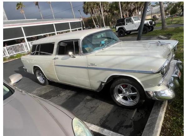
Skip Ferguson's '55 Chevy Nomad Wagon