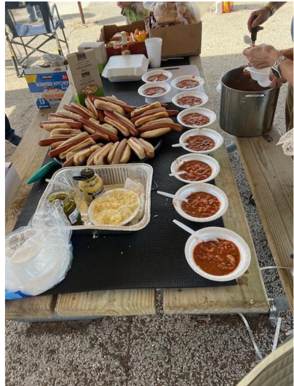
The luncheon spread was amazing!