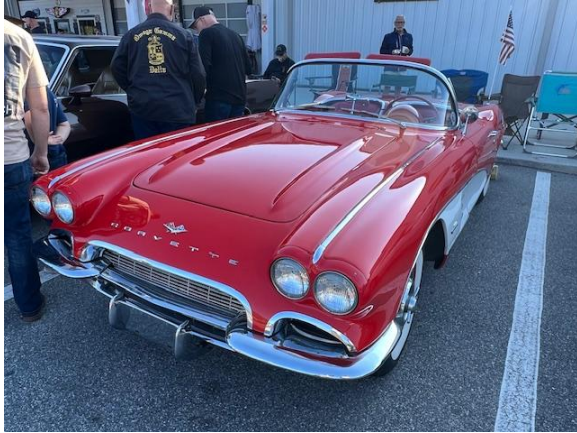
Bill Soman's '61 Corvette convertible