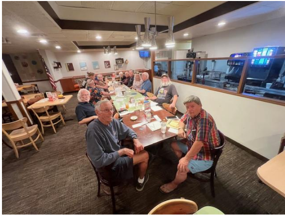
The rest of the Gang