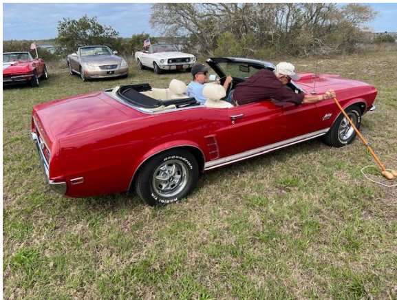
Stabbing a potato is harder than you think.