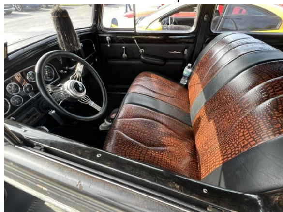
The Cadillac upholstery