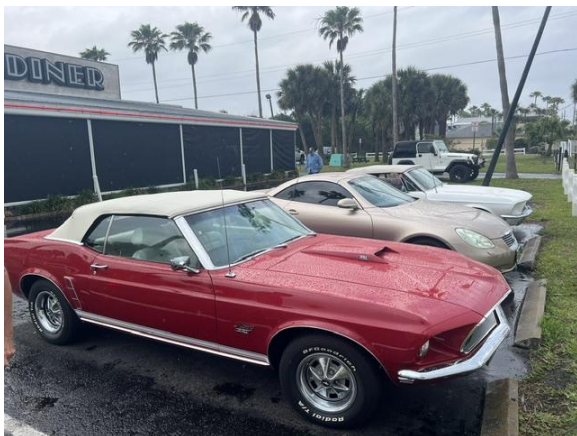
It was a rainy day in St. Augustine!

Put the OGB on your calendar, June 12 at 9 AM. Hope to see you there.