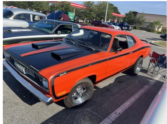
Ed Downing's 72 Duster