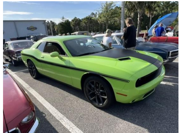
Ed Downing's 2023 Dodge Challenger