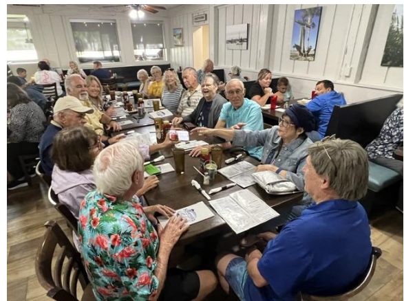
famously good food.