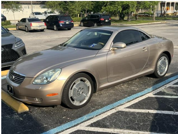
Joe Greeves 04 Lexus SC 430