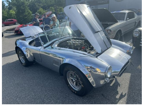
A rare, polished aluminum Kirkham Cobra replica