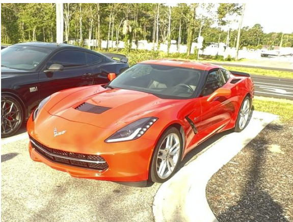
Jimmy Pucci's 2018 Corvette Stingray