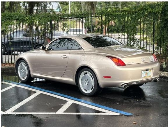
And one brave driver!