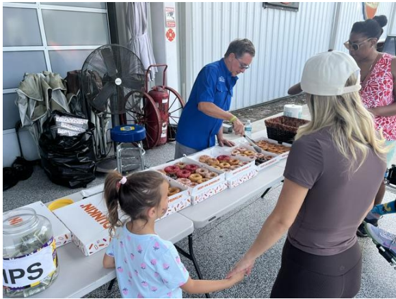
Everybody loves doughnuts

This Saturday morning event always turns out to be special on so many levels. It's a two-hour get together that starts at eight and ends at ten, although some drivers apparently arrive at 6:30 to get their favorite spot! Folks from around the area uncover their special rides and inevitably, there are a dozen or so that you've never seen before. There are dozens more that are familiar, giving you a chance to re-acquaint with their owners.