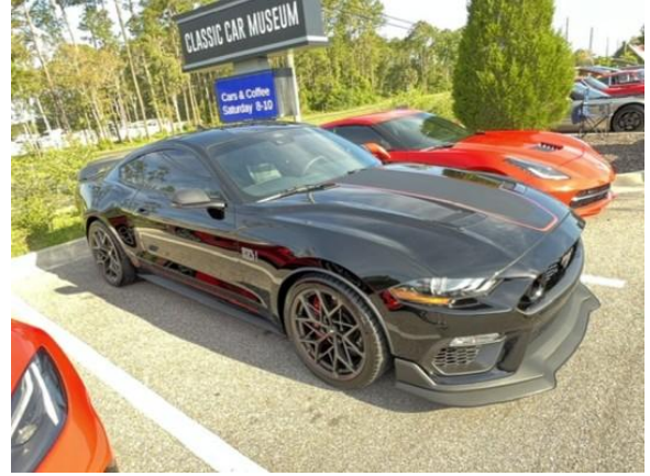
Russell Pucci's 2022 Mustang Mach 1