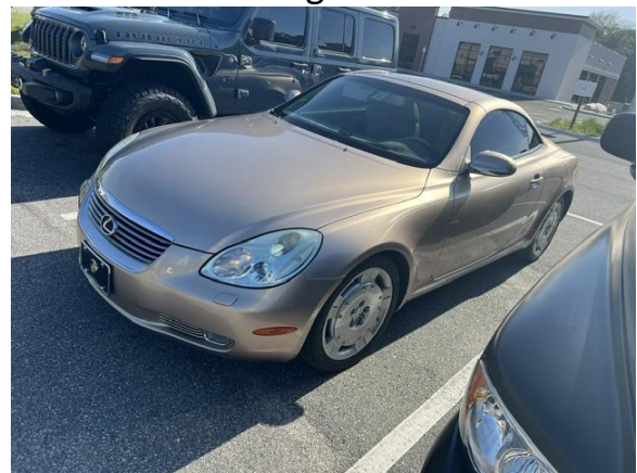
Joe Greeves Lexus SC 430