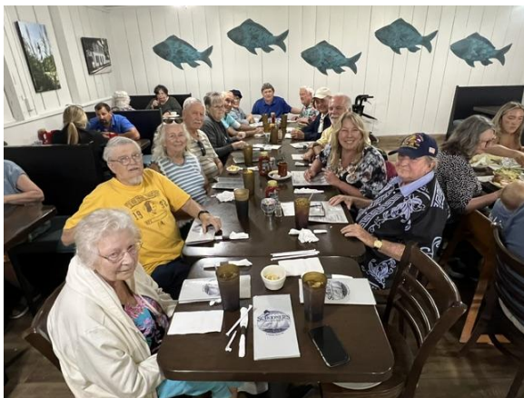
Everyone enjoyed the restaurant's

When it was time to leave, the late evening sunshine meant no one got wet on the way to their cars. Sign up for club events like this when your schedule permits, even if there is a Mother Nature soft water car wash predicted. After all, it's just a little rain.