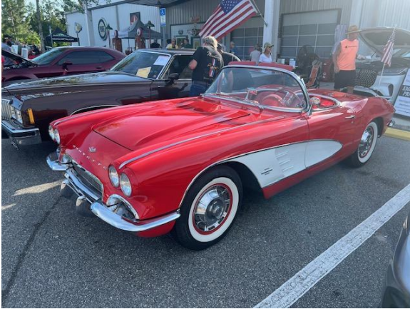
Bill Soman's '61 Corvette convertible