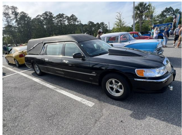
High-performance hearse with a hood scoop