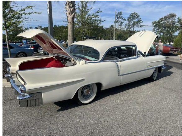
A stylish Cadillac two-door hardtop