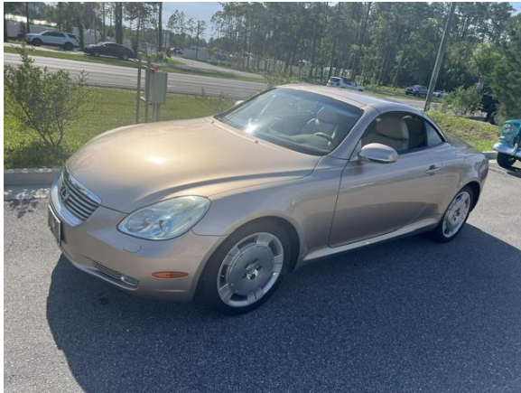
Joe Greeves Lexus SC 430

Put June 20 on your schedule and join next month's fun.