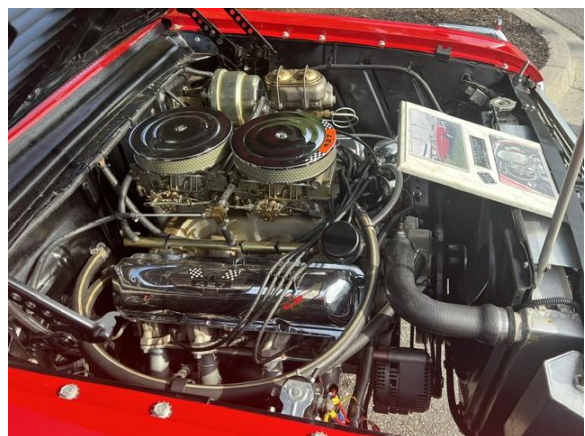
The 427 engine